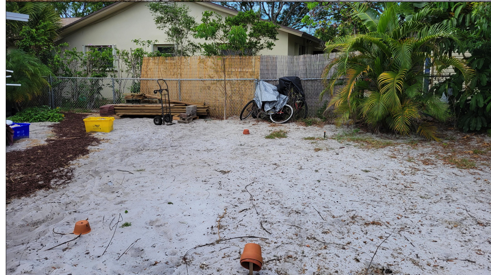
EXISTING CONDITIONS SCALE: 1:6.32