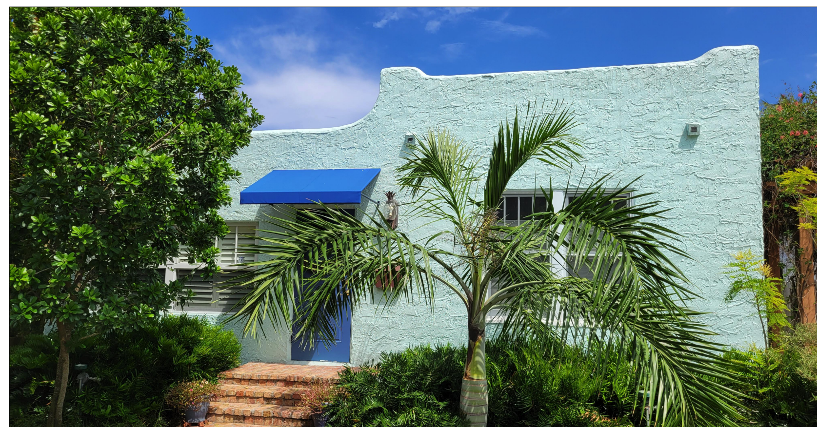
2 ADJACENT PROPERTY SCALE: 1:6.45