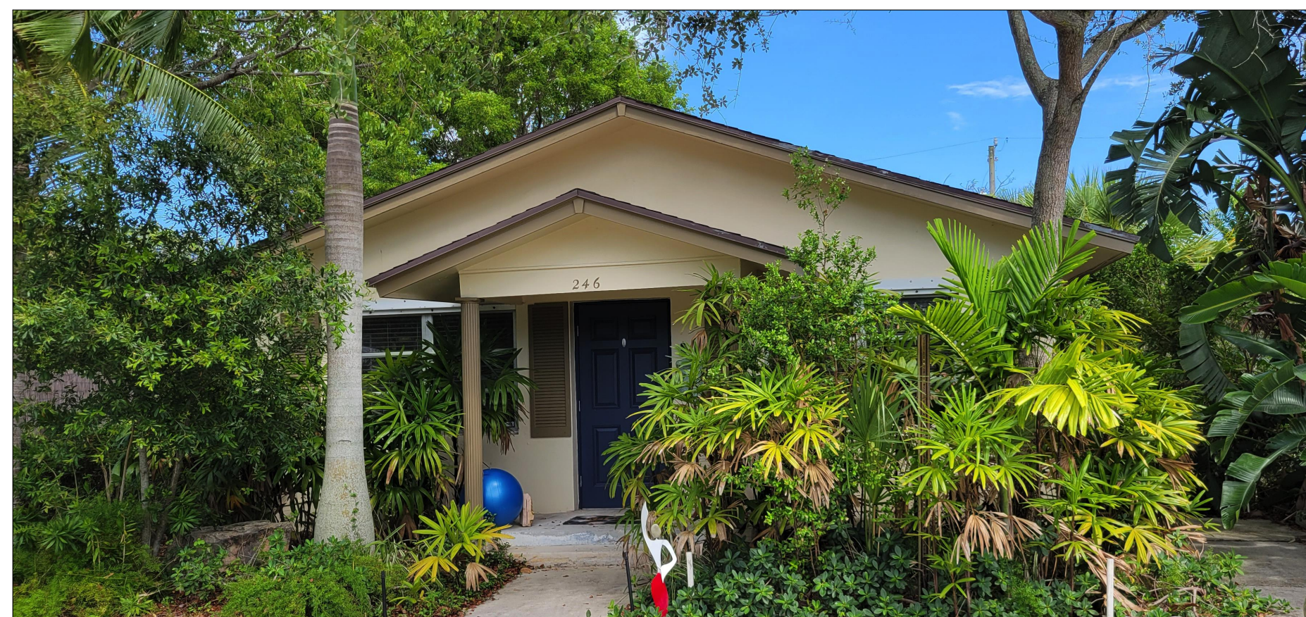
1 ADJACENT PROPERTY SCALE: 1:5.20