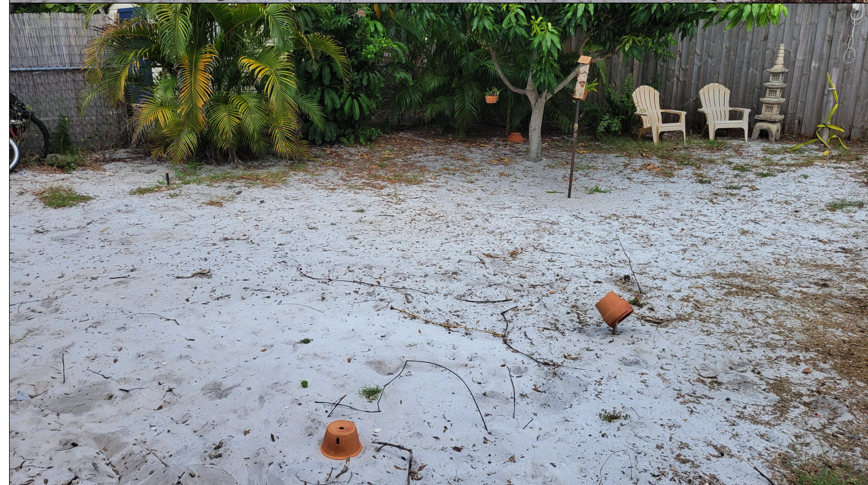
EXISTING CONDITIONS SCALE: 1:6.32