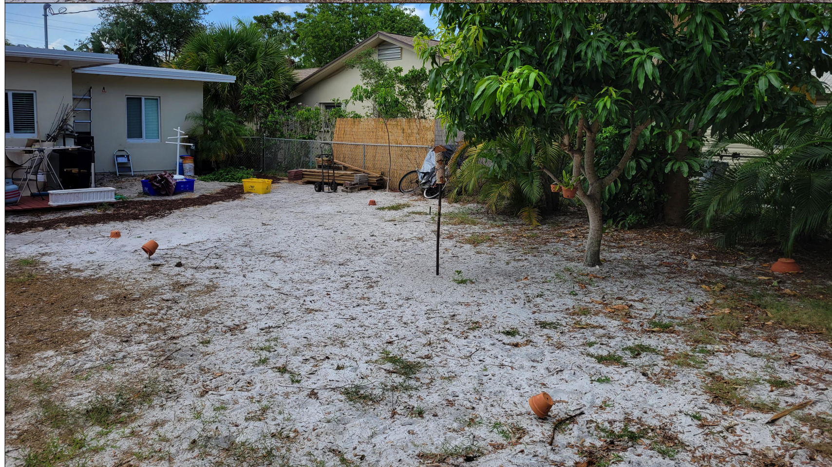
EXISTING CONDITIONS SCALE: 1:6.32