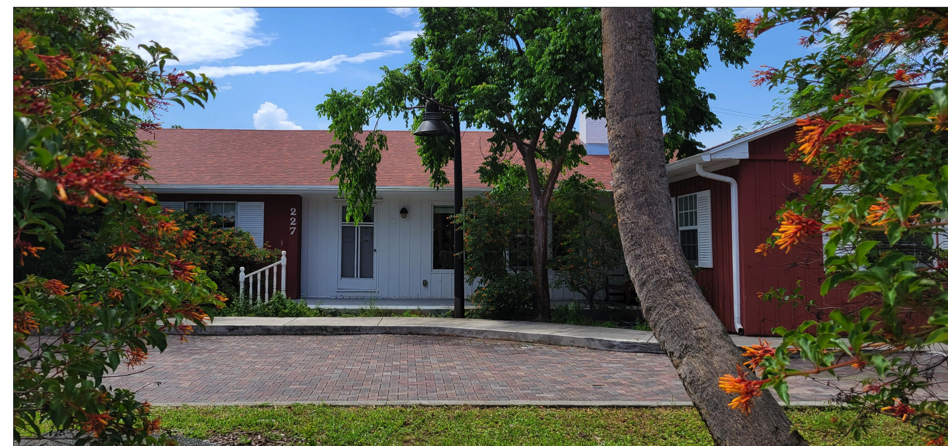
3 ADJACENT PROPERTY SCALE: 1:5.35