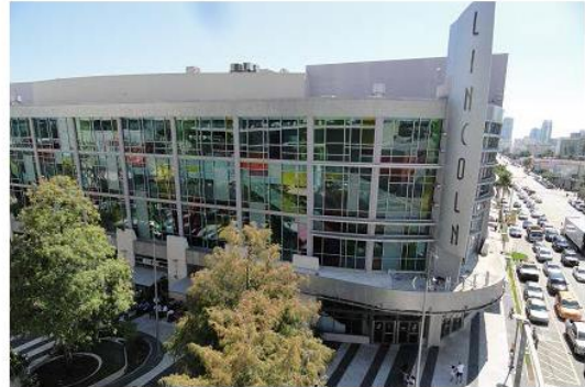
The Lincoln Theater has the building circulation located along the streets, behind an architectural glass façade, screening the large expanses of blank walls within the movie theater.