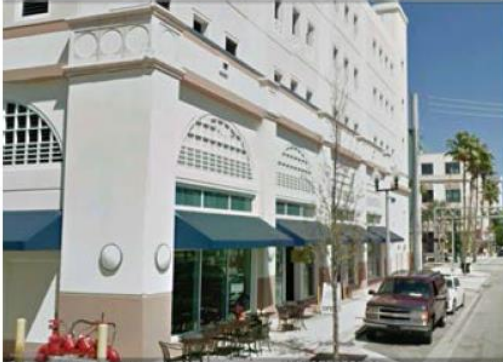
The Clematis Street garage utilizes consistent building materials with fenestration patterns to establish an attractive façade screening the parking levels over the retail space.