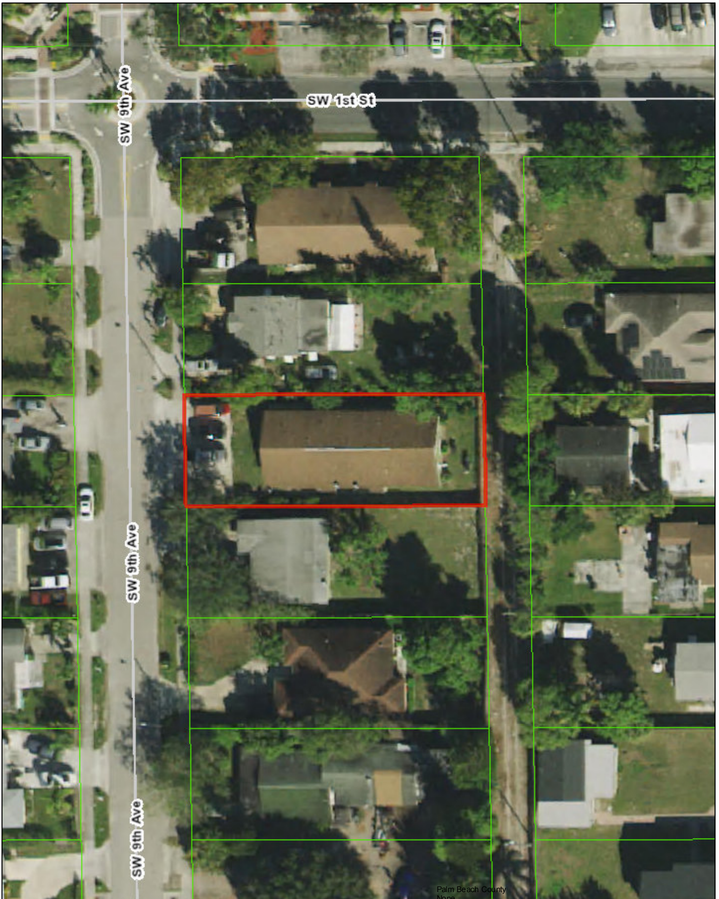
EXHIBIT A - LOCATION MAP (107/109) 12-43-46-17-38-000-0270