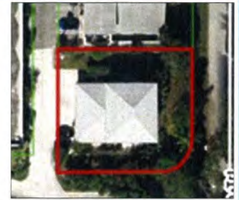
AERIAL PHOTOGRAPH (MAY NOT SHOW LATEST IMPROVEMENTS) (NOT-TO-SCALE)