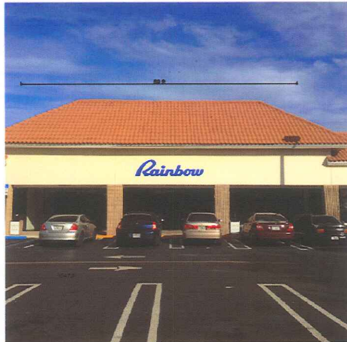
A Front - Lit Acrylic Face Channel Letters