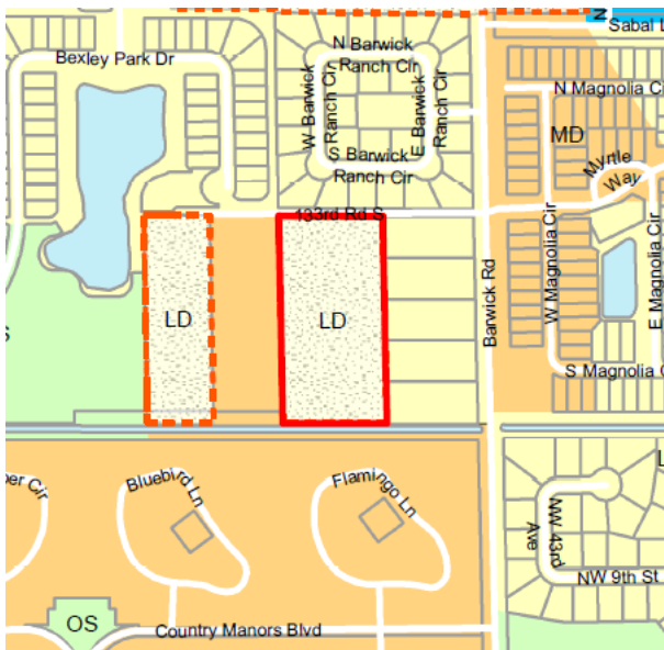
Existing Land Use

The existing and proposed land use and zoning is depicted on the following maps; full-sized maps of the proposed land use and zoning are attached.