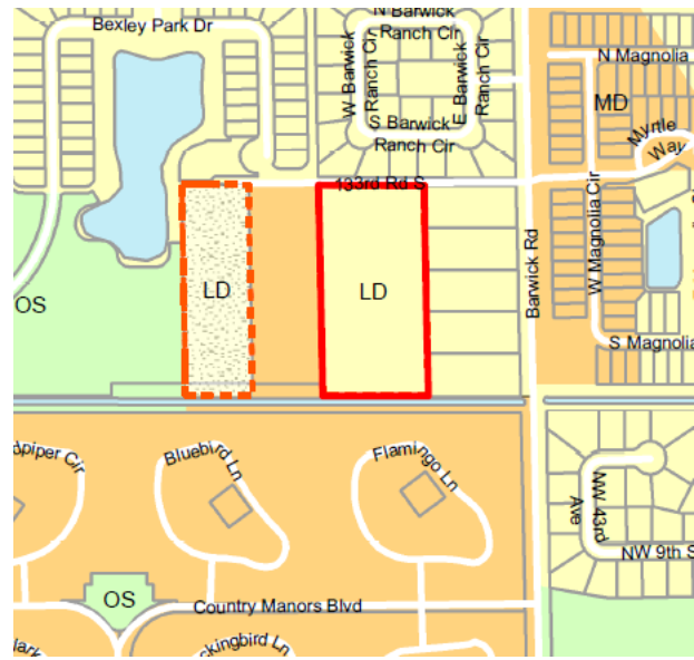
Proposed Land Use