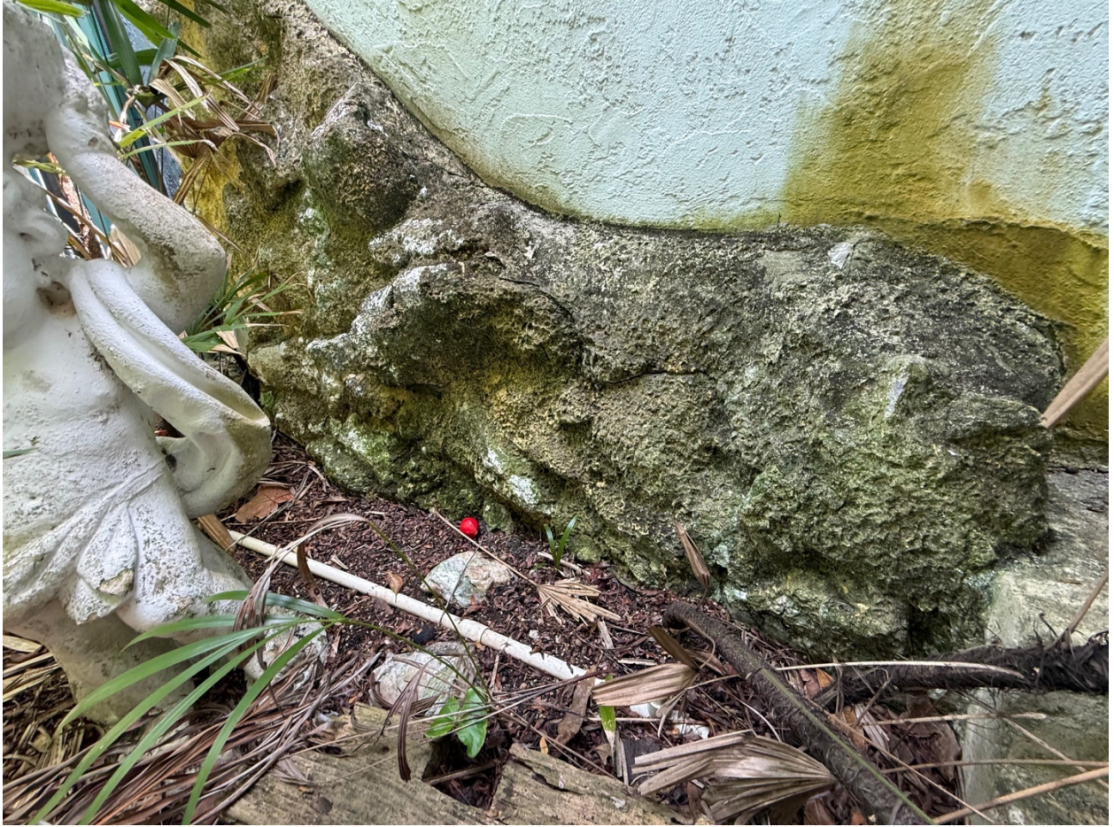
Sample of Proposed Coral Stone Below