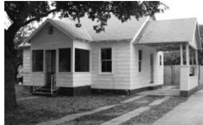
An example of weatherboard siding