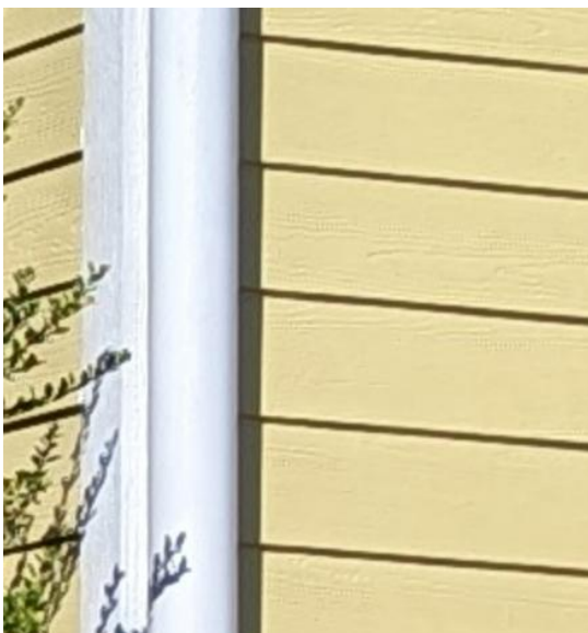
Wood grain on 3 NE 1 st Avenue