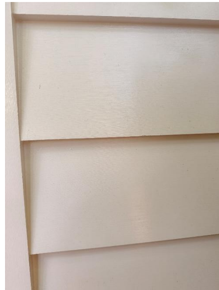
Smooth paint finish on 49 Palm Square