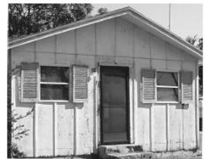
Board and batten siding

Consideration could be given to the utilization of a non-authentic alternatives on portions of the building not visible from the public right-of-way along with the overall finish of the siding. Typically, a request for siding replacement is reviewed by staff at the administrative level. However, since the project has already been completed and the non-authentic material has been utilized, the application must be reviewed by the board in order to make a determination that the request is appropriate for the contributing structure and compatible to the Marina Historic District. Additionally, a further complication of the Azek material that has been utilized is that it does not have a current Notice of Acceptance (NOA). Either a NOA or letter, provided and signed by a licensed professional, indicating that the installed material meets the Florida Building Code is required and necessary for building permit approval in order to comply with engineering and Florida Building Code hurricane wind load requirements. Such will need to be provided for building permit approval.