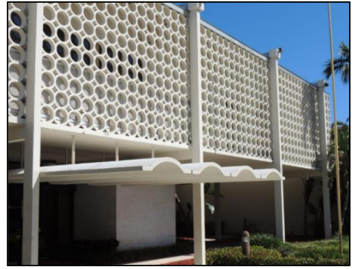
1133 Normandy Drive, Miami Beach

MiMo structures were predominantly horizontal structures accented with limited but strong vertical features. The horizontal design emphasis was for climatic reasons as well as by esthetic choice. The wide overhanging roof eaves, catwalks and banded windows all contributed to the horizontal directional emphasis, while also protecting from the effects of both sun and rain. Roofs were generally flat with overhanging roof plates and projecting floor slabs along with paired or clustered pipe columns.