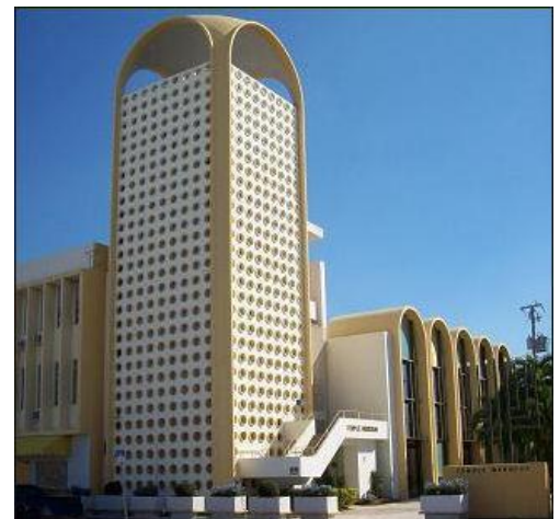
620 75 th Street, Miami Beach