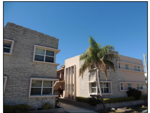
7344-7350 Bryon Avenue, Miami Beach