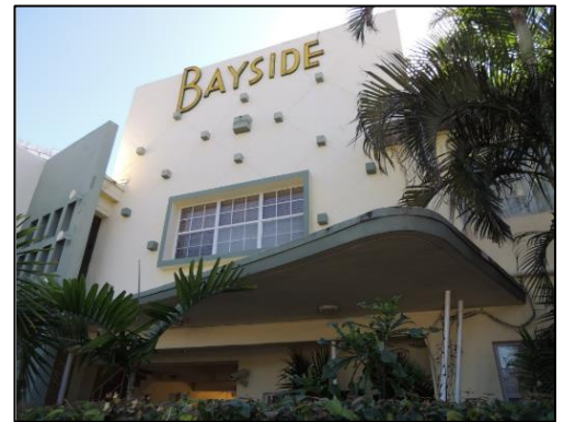
910 Bay Drive, Miami Beach