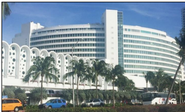
4441 Collins Ave, Miami Beach