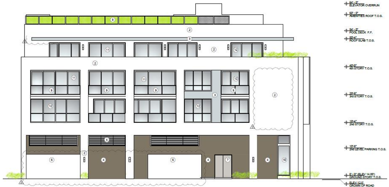
2 A-201 WEST ELEVATION - ALLEY SCALE: 1/8" = 1'-0"