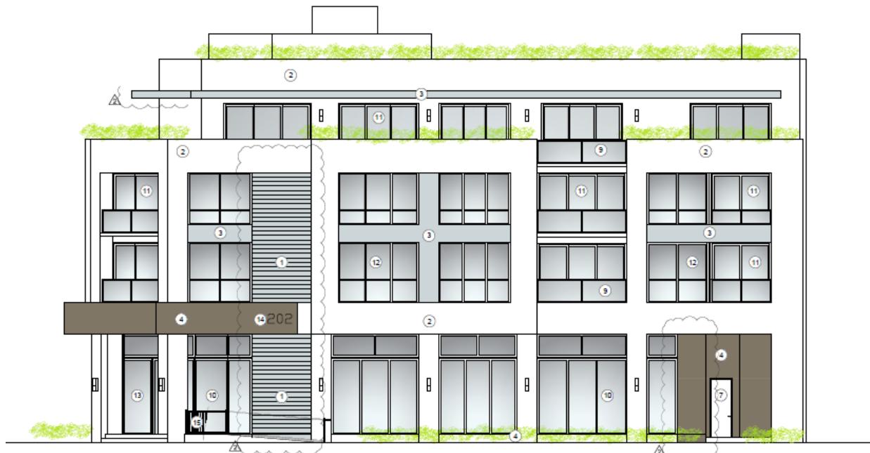
2 A-200 EAST ELEVATION SCALE: 1/8" = 1'-0"