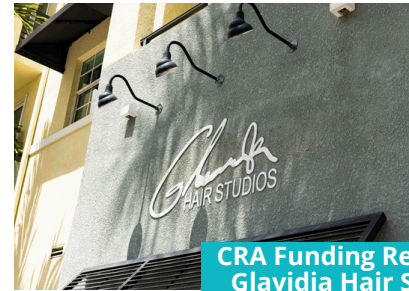
CRA Funding Recipient: Glavidia Hair Studios