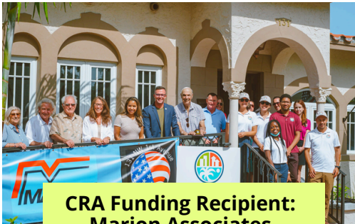
CRA Funding Recipient: Marion Associates

Marion Associates received funding through the CRA’s Site Development Assistance Program, which provided reimbursement for improvements made to the property, including interior and exterior commercial property improvements. More .