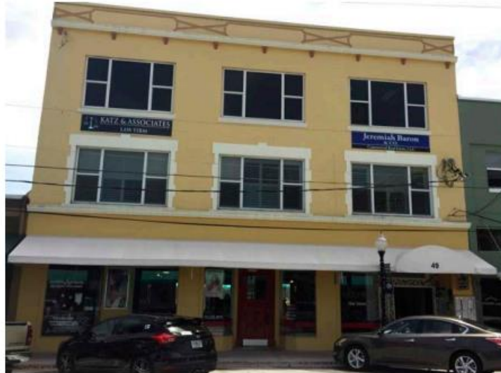
49 SW FLAGLER AVE. STUART, FL. A mixed use building with storefronts on the ground floor and an entry providing access to upper story offices. The facade is comprised of a three bays. Ornamentation is a simple cornice line between the first and second stories, an articulated parapet, and lintels over second story windows.