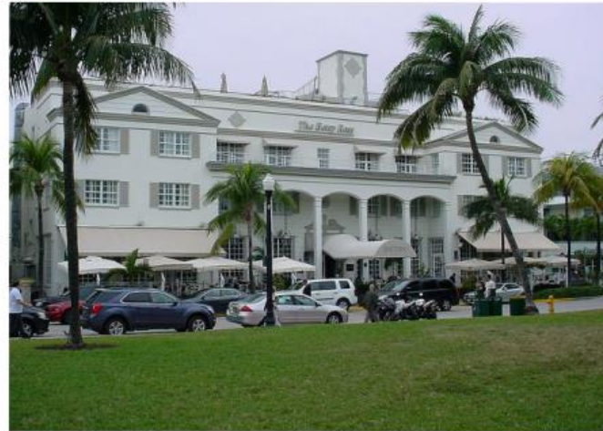
THE BETSY ROSS, MIAMI BEACH, FL This hotel has a classical, symmetrical facade with a double-height porch in the center flanked by volumes with simple gabled ends. Windows align in vertical pattern. The modest detailing is also consistent with Florida Vernacular architecture's application of classical trim.