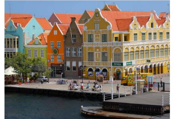
WILLEMSTAD, CURACAO: The origin of the style has European roots and vernacular adaptations from the Caribbean. Curacao shows some of the Dutch and Portuguese influence that was introduced to the region in the colonial era. The embellished parapet walls and steeper roof pitches remain central compositional features of the style.