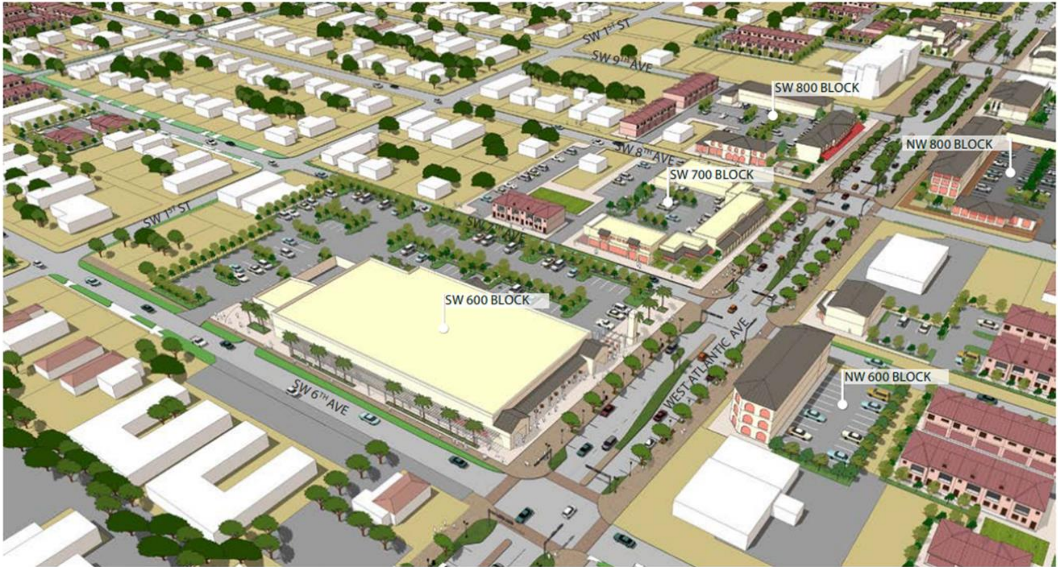
PROPOSED REDEVELOPMENT OF CRA OWNED PROPERTIES ALONG WEST ATLANTIC AVENUE