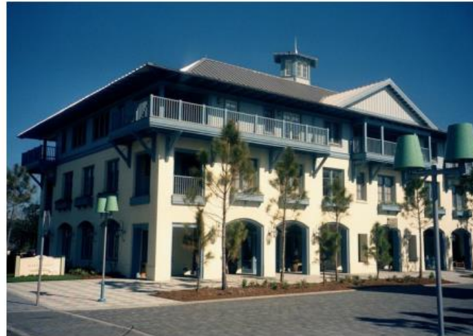
WATERCOLOR, FL. Designed by Cooper Robertson, this is an excellent example of a recently constructed Anglo-Caribbean building. The building clearly expresses the base, middle, and top. The design incorporates varied detailing adding richness to the simple facade.