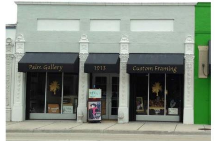
1913 S. DIXIE HIGHWAY, WEST PALM BEACH, FL. This shop illustrates the type of ornamental friezes and pilasters that were frequently incorporated in the 1920s. Buildings remain simple in form with decorative elements typically applied between bays, around openings, or within parapets.