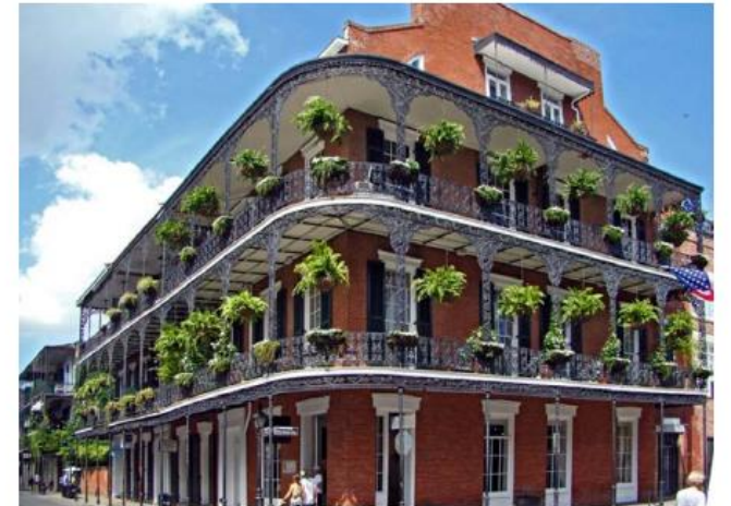
FRENCH QUARTER, NEW ORLEANS, LA. New Orleans was founded by the French, and occupied by the Spanish before being part of the Louisiana purchase. This eclectic style includes stacked porches, surrounding masonry structures, awnings, and expressive parapet and end walls.