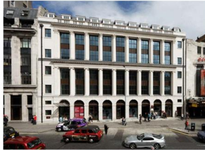
TOTTENHAM COURT ROAD, COMMERCIAL BUILDING, LONDON This recently constructed commercial building was designed by Quinlan Terry. The six-story building is cleverly disguised in a three-story composition. This play of scale maintains classical proportions while making the building appear smaller.

“Classical” Architecture can be defined as the architecture of ancient Greece and Rome. Classicism uses a specific vocabulary, “the orders,” which provide a specific and detailed design framework. Books written about Classical architecture by architects such as Vitruvius, Alberti, Serlio, and Palladio, remain relevant today and should be referenced when designing a Classical building.