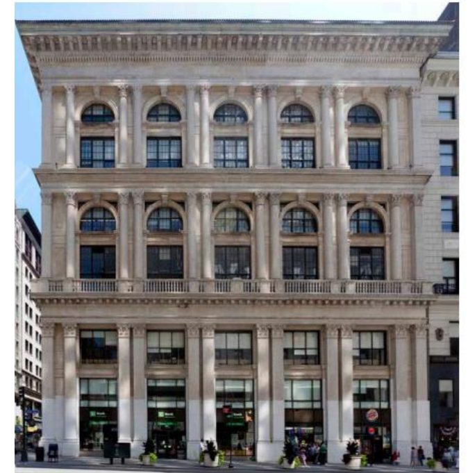
BUILDING FOR TIFFANY AND CO, NEW YORK. Architect: McKim, Mead and White, 1906.