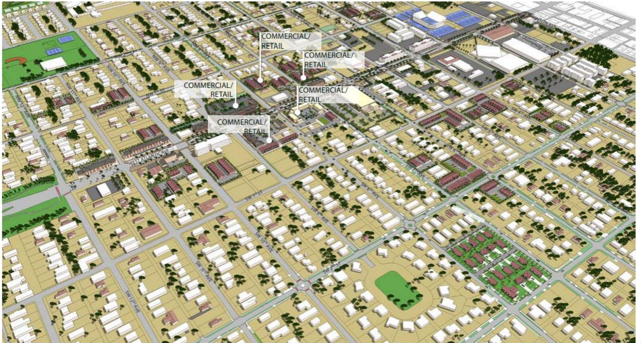
Proposed Plan of Redevelopment Projects along W Atlantic Av.