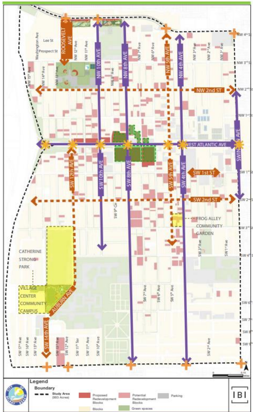
THE WEST ATLANTIC REDEVELOPMENT CONCEPT