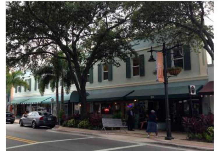
CLEMATIS CENTRE, WEST PALM BEACH, FL. This two-story building contains stores in the first story and residences in the second story. The facade is comprised of a series of storefronts and regularly spaced, vertically-proportioned windows with shutters in the second story.