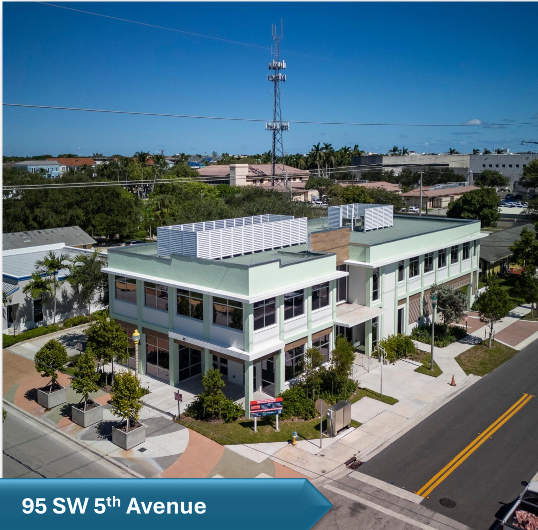
95 SW 5 th Avenue