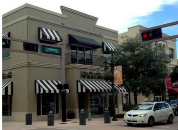
MIXED-USE BUILDING, WEST PALM BEACH, FL. This Main Street Vernacular example has a symmetrical facade comprised of three bays, with the center emphasizing entry to the store. Ornamentation is limited to a simple cornice line between the first and second stories and an articulated parapet. Shade is provided from awnings and street trees.

The Main Street Vernacular is a style of architecture that encompasses the traditional commercial and mixed-use buildings that have shaped successful main streets throughout the region since the 1900s. Storefronts line the sidewalk and frequently, one or two upper stories contain offices or residences. The buildings are structurally simple, comprised of a bay or series of bays and openings that are aligned over each other. Depending upon the era of construction, the buildings may have only simple cornice lines at the top of the first story and on the parapet or may incorporate ornamentation in the form of friezes, gilding, keystones, and quoins.