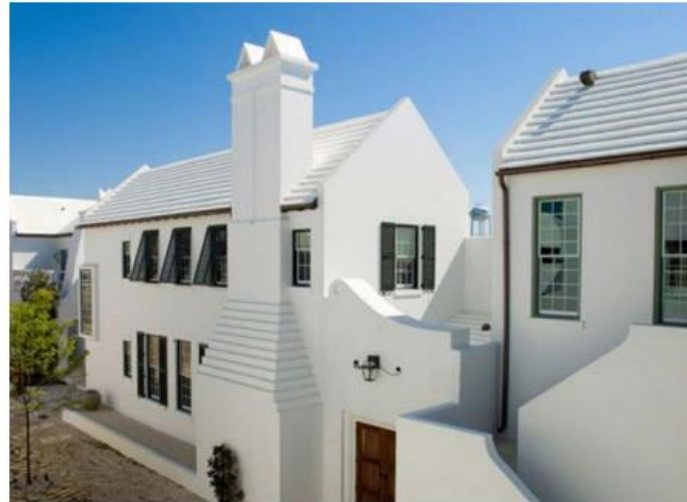
57 GOVERNORS COURT, Alys Beach, FL. Anglo-Caribbean architecture typically elaborates and sculptural shapes masonry elements. Generally this detailing occurs on the parapets, chimneys, entries, and stairways.

Anglo-Caribbean architecture is often considered an eclectic style, common to the British-settled isles of the Caribbean and influenced by Portuguese, Dutch, French, and Spanish colonizations. Anglo-Caribbean architecture is characterized by wooden upper floors and roofs historically added over time to the masonry ground floors of initial settlements. The style today often references this through a change in material between floors or as a predominantly masonry construction with sculptural transitions between horizontal and vertical areas, incorporating wood building features.