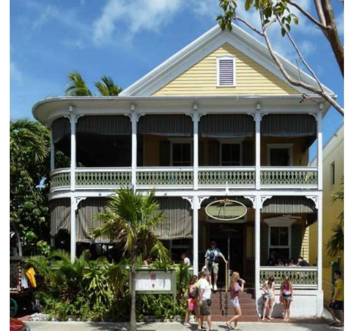
115 DUVAL STREET, KEY WEST, FL.

AUDUBON HOUSE, KEY WEST, FL. This building has a classical, symmetrical composition. The ground-story porch has simplified classical columns. Operable shutters are sized proportionally to the openings they cover.