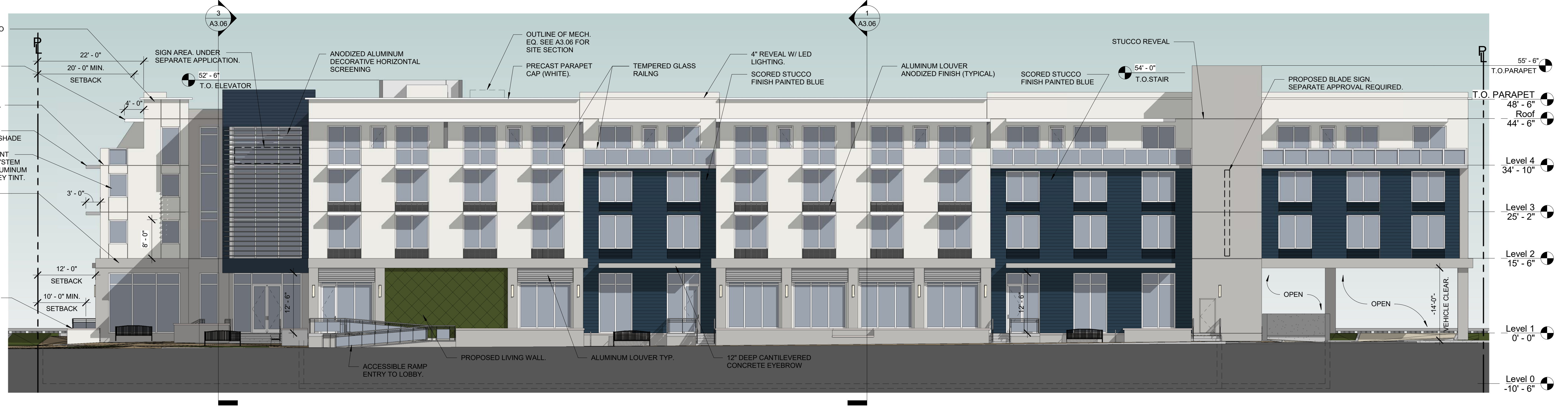
1 EAST ELEVATION - N. FEDERAL HIGHWAY A3.01 3/32" = 1'-0"