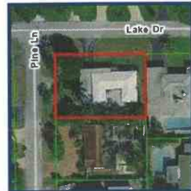
AERIAL PHOTOGRAPH (NOT-TO-SCALE)