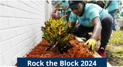
Rock the Block 2024 Preview

This exciting annual event aims to revitalize one community in Delray, and does so by uniting hundreds of volunteers in a block party-style, hands-on volunteer experience. Together, 10 homes will be transformed in just one day. More