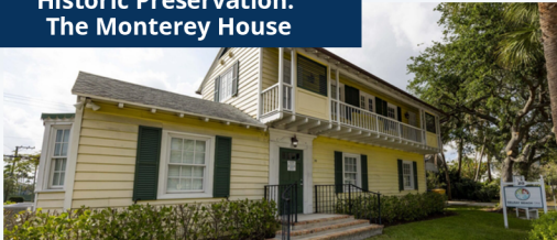
Historic Preservation: The Monterey House