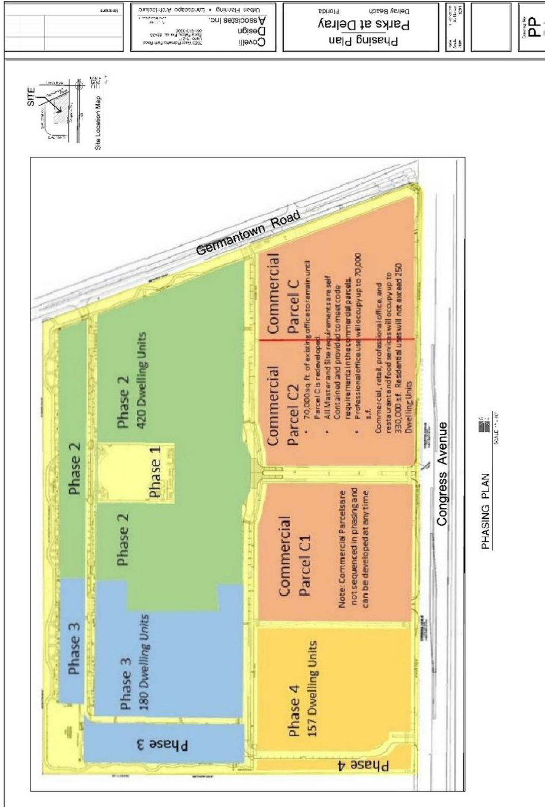
Exhibit "E" Phasing Plan