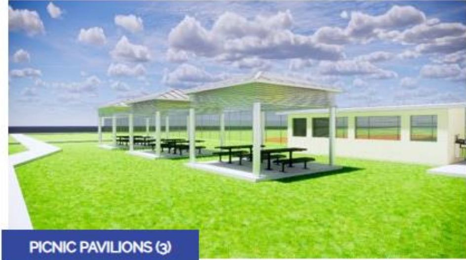
PICNIC PAVILIONS (3)