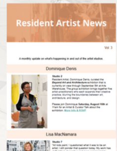
Newsletter sent monthly