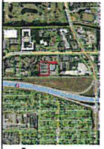
NOT TO SCALE VERTICAL

ACCORDING TO THE PLAT THEREOF AS RECORDED IN PLAT BOOK 38 PAGE 143 OF THE PUBLIC RECORDS OF PALM BEACH COUNTY, FLORIDA