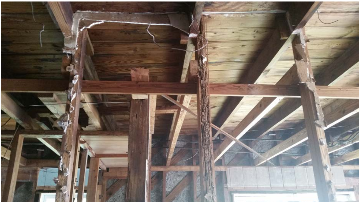
Exhibit 2. Typical Rotted Wood Wall Studs