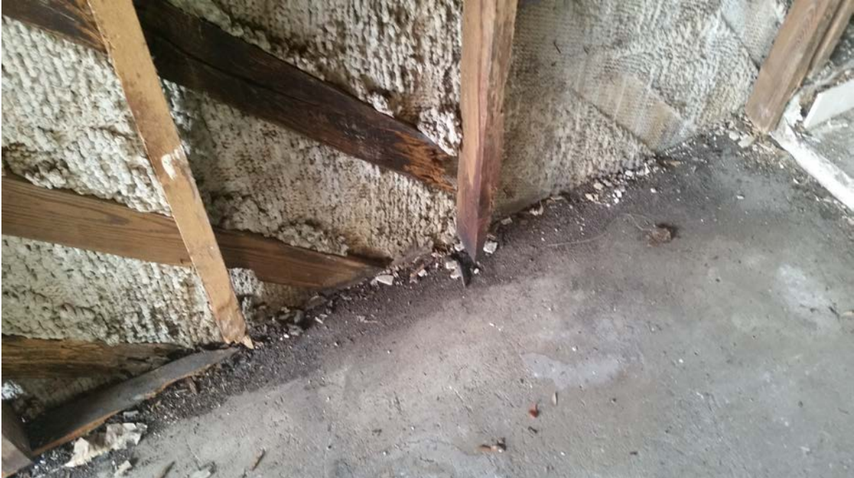
Exhibit 5. Typical Missing/eroded base plate of exterior wood frame walls

(561) 756 4106 * fax (561) 479 3743 * engplus@cs.com * C.A. # 26538