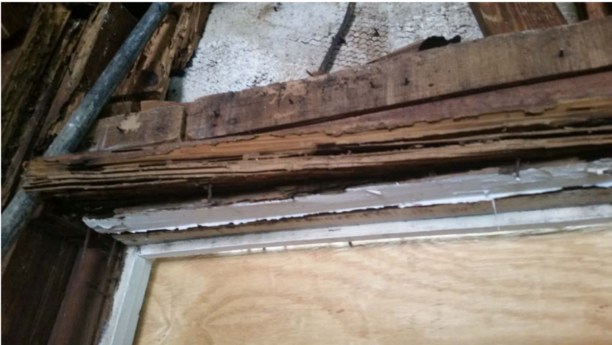
Exhibit 6. Typical rooted wood header/jamb at exterior openings