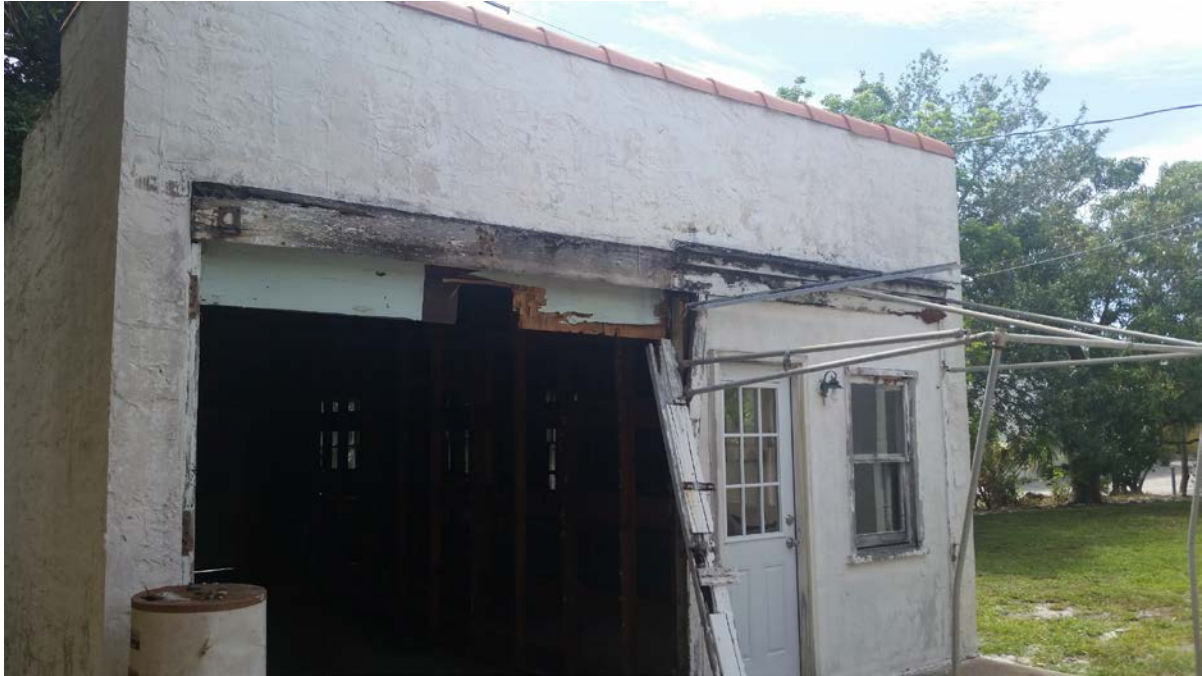
Exhibit 1. General view of Exterior of the Building through garage

(561) 756 4106 * fax (561) 479 3743 * engplus@cs.com * C.A. # 26538