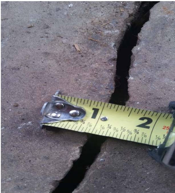
Exhibit 12. Typical Crack separation