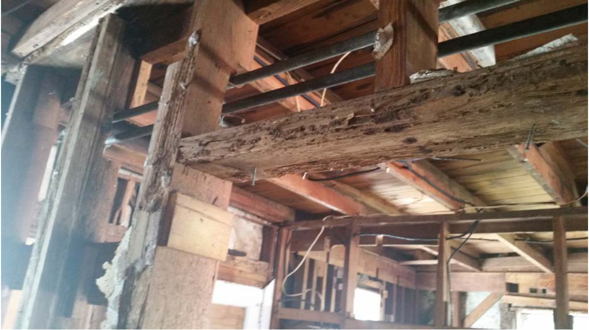
Exhibit 7. Typical rotted wood header at interior load bearing walls

(561) 756 4106 * fax (561) 479 3743 * engplus@cs.com * C.A. # 26538