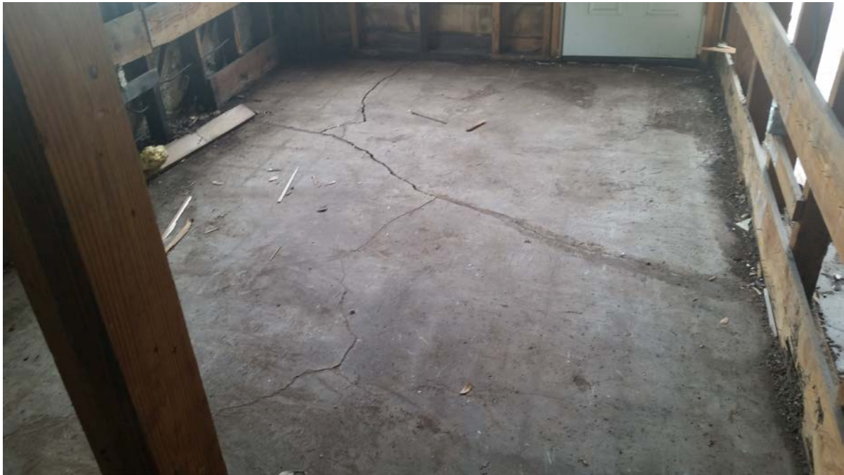
Exhibit 11. Typical Continuous Concrete slab cracks at room

(561) 756 4106 * fax (561) 479 3743 * engplus@cs.com * C.A. # 26538