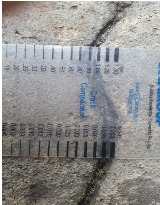
Exhibit 13. Typical Crack separation

(561) 756 4106 * fax (561) 479 3743 * engplus@cs.com * C.A. # 26538