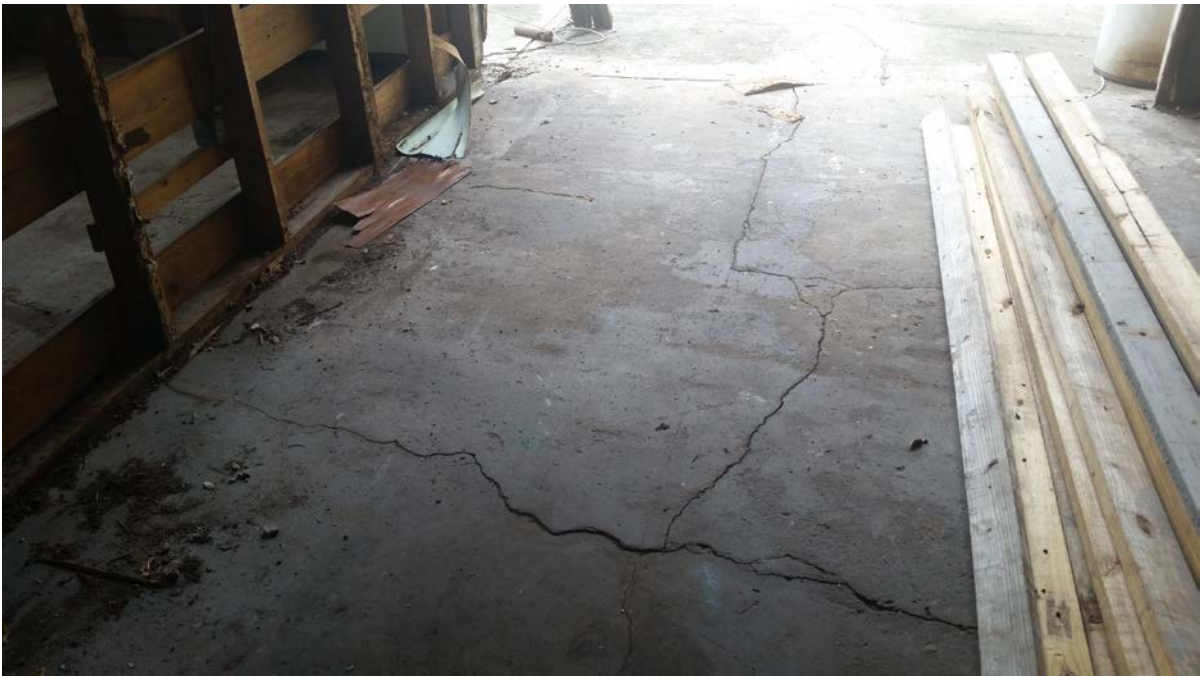
Exhibit 8. Typical Continuous Concrete slab cracks