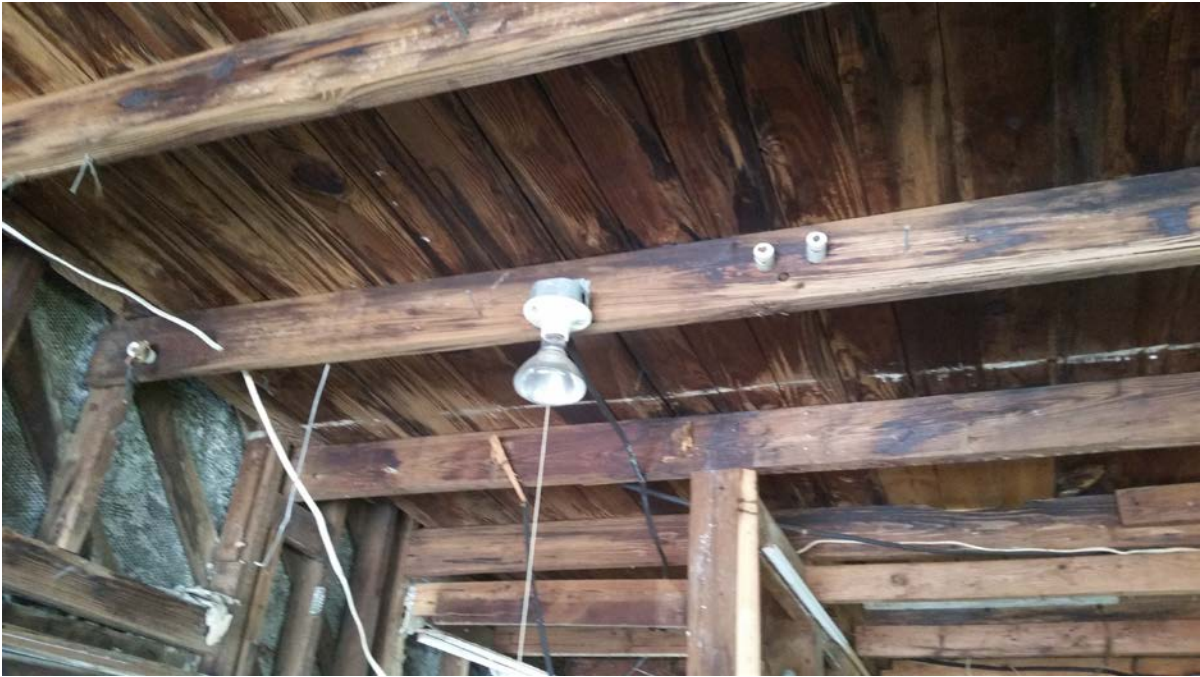
Exhibit 3. Water damaged roof joist, decking and ledger board

(561) 756 4106 * fax (561) 479 3743 * engplus@cs.com * C.A. # 26538