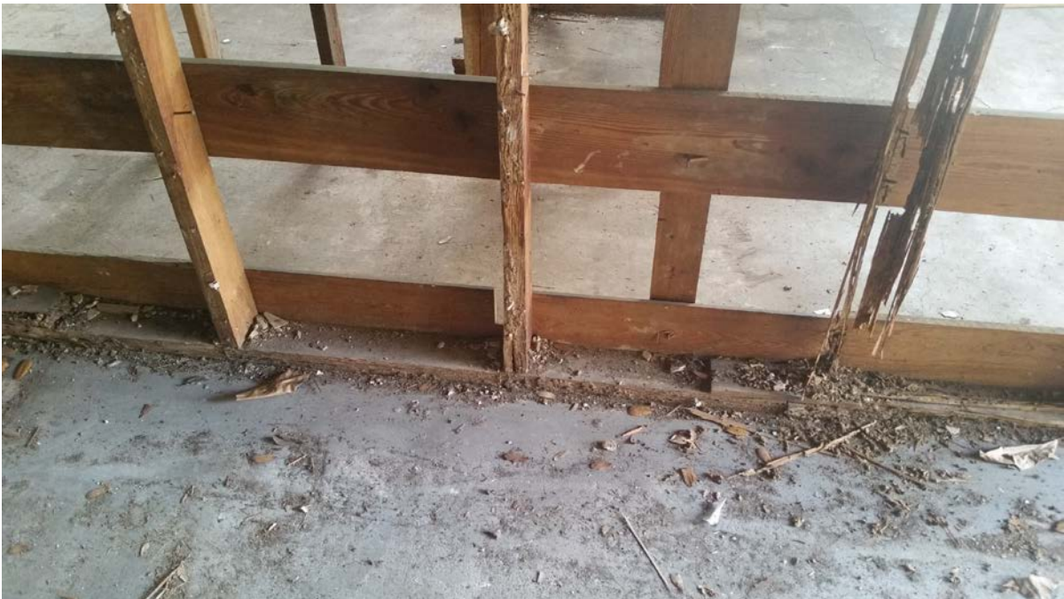
Exhibit 4. Typical missing/eroded wood wall studs