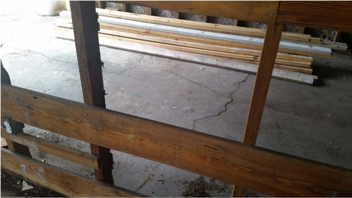
Exhibit 9. Typical Continuous Concrete slab cracks at garage area

(561) 756 4106 * fax (561) 479 3743 * engplus@cs.com * C.A. # 26538