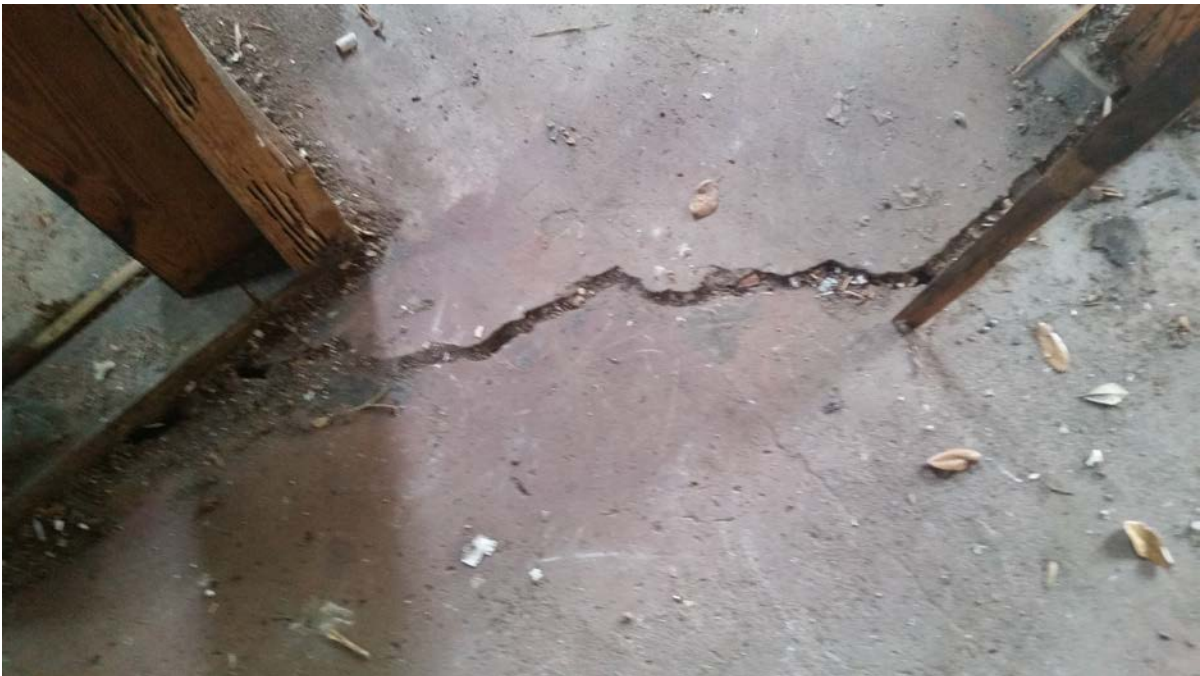
Exhibit 10. Typical Continuous Concrete slab cracks