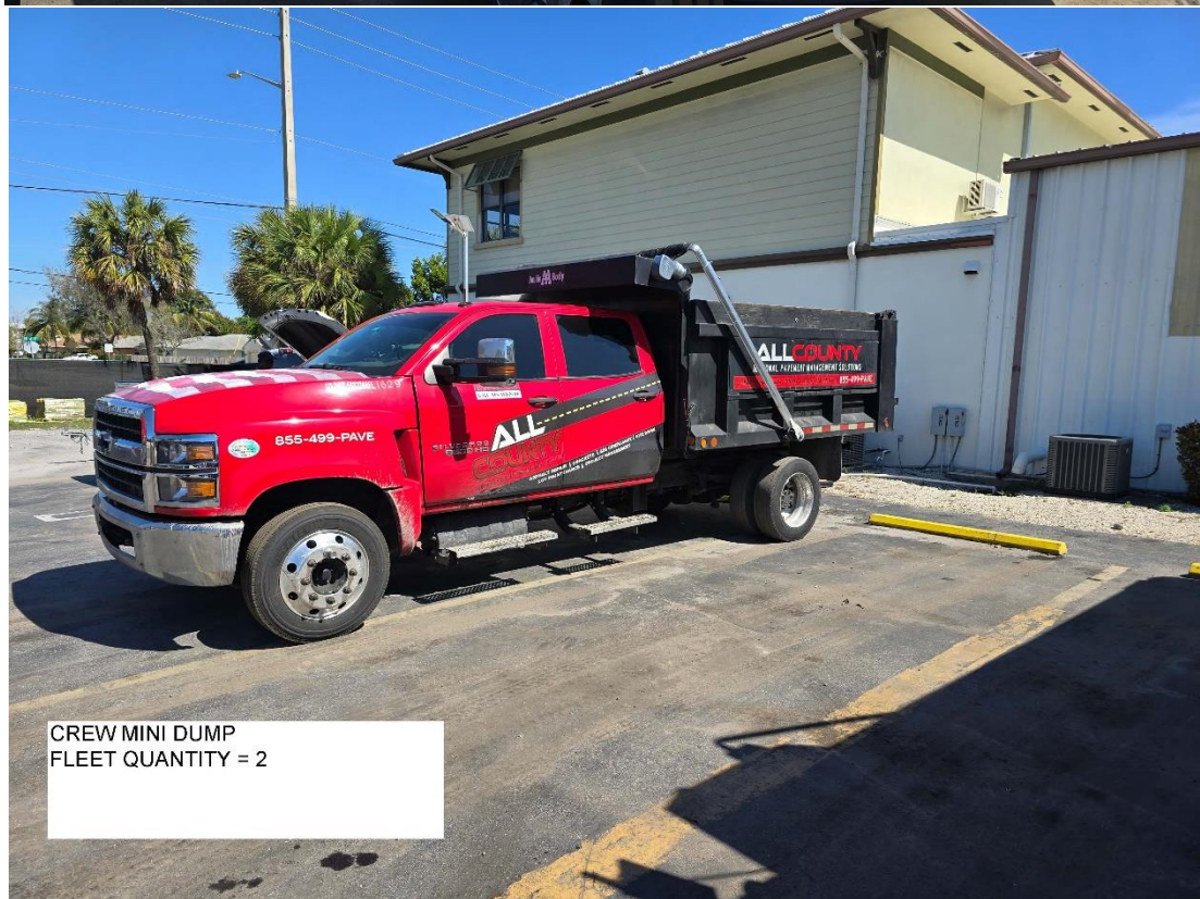
CREW MINI DUMP FLEET QUANTITY = 2