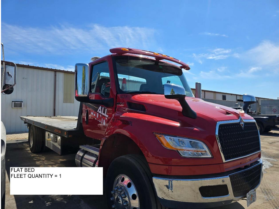
FLAT BED FLEET QUANTITY = 1