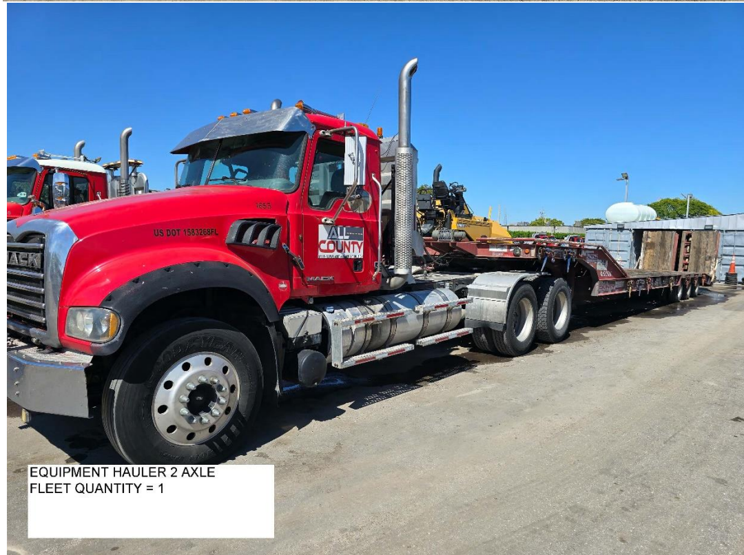
EQUIPMENT HAULER 2 AXLE FLEET QUANTITY = 1