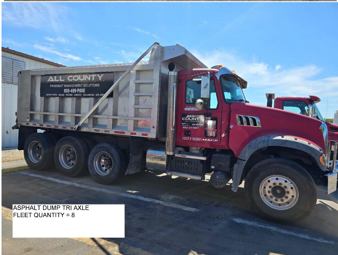
ASPHALT DUMP TRI AXLE FLEET QUANTITY = 8