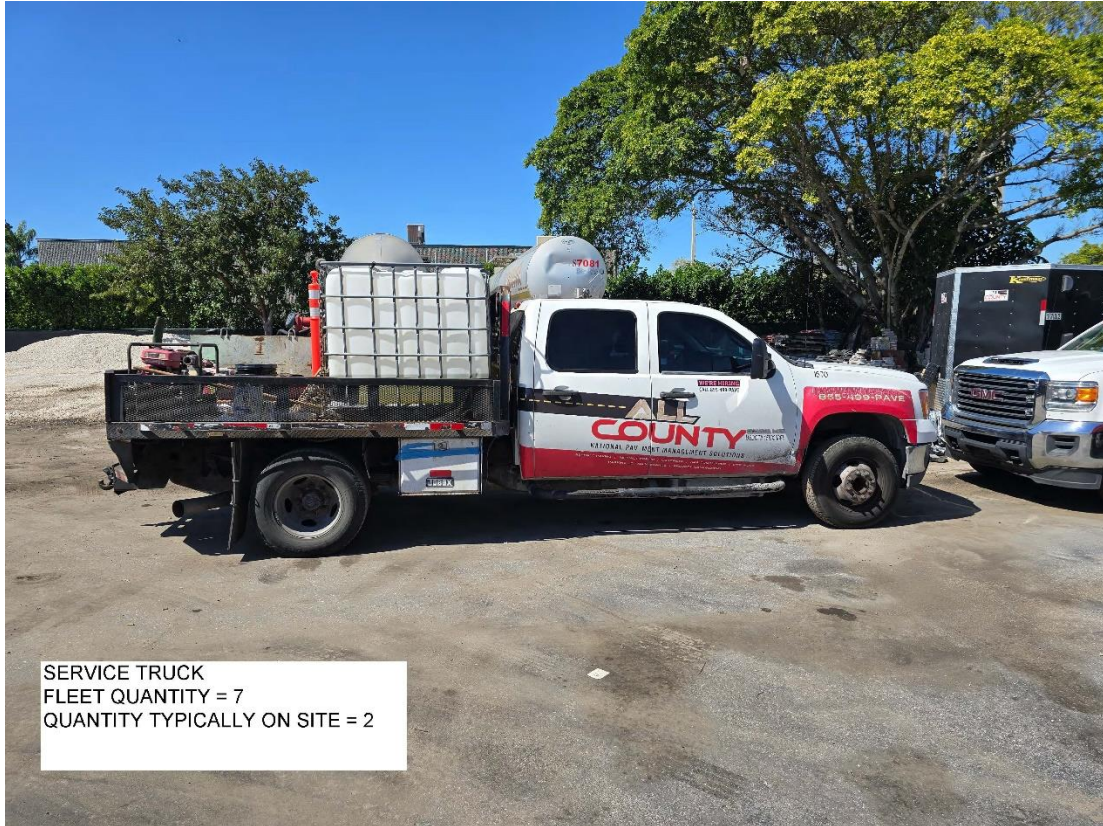
SERVICE TRUCK FLEET QUANTITY = 7 QUANTITY TYPICALLY ON SITE = 2