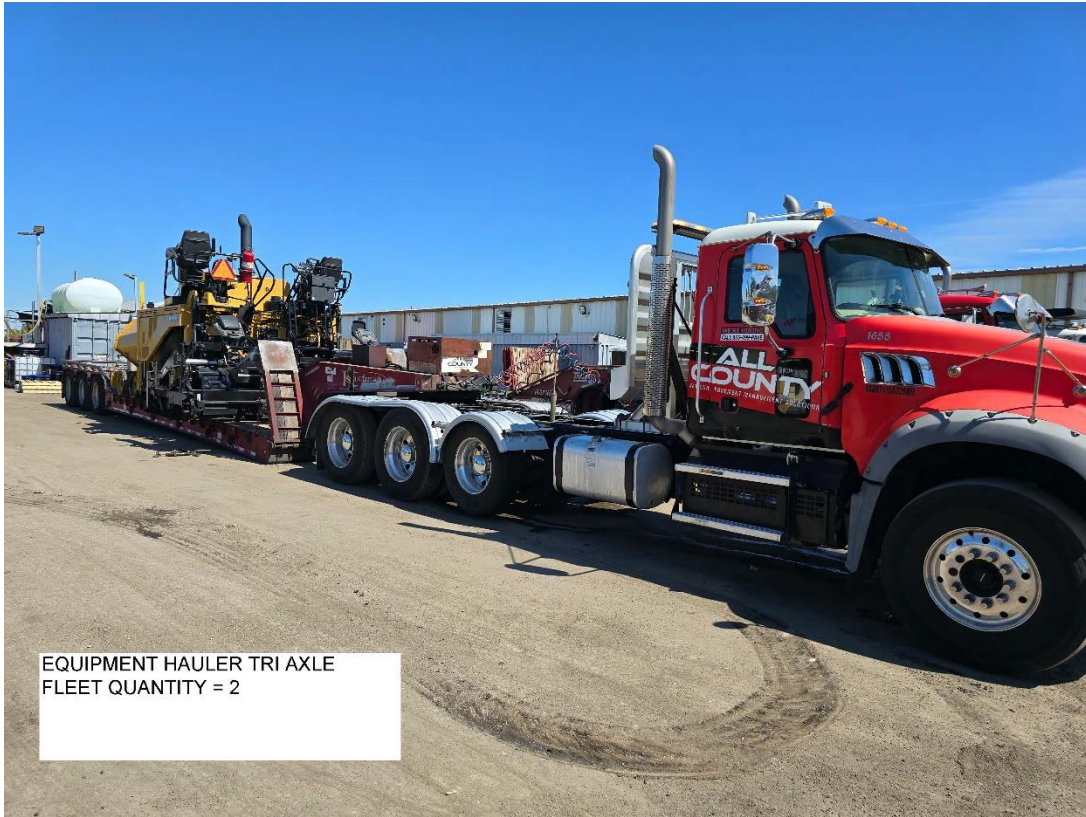
EQUIPMENT HAULER TRI AXLE FLEET QUANTITY = 2