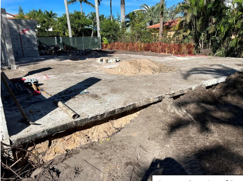
Removed portion of South Addition not previously approved. See Justification statement.