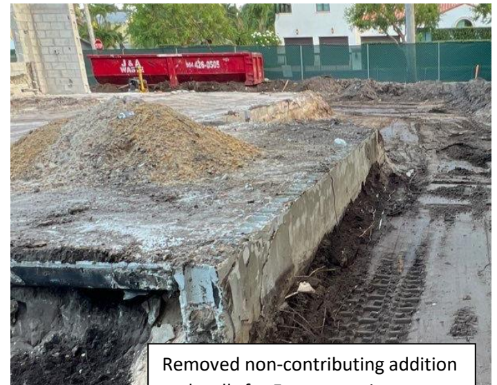
Removed non-contributing addition and walls for East expansion.