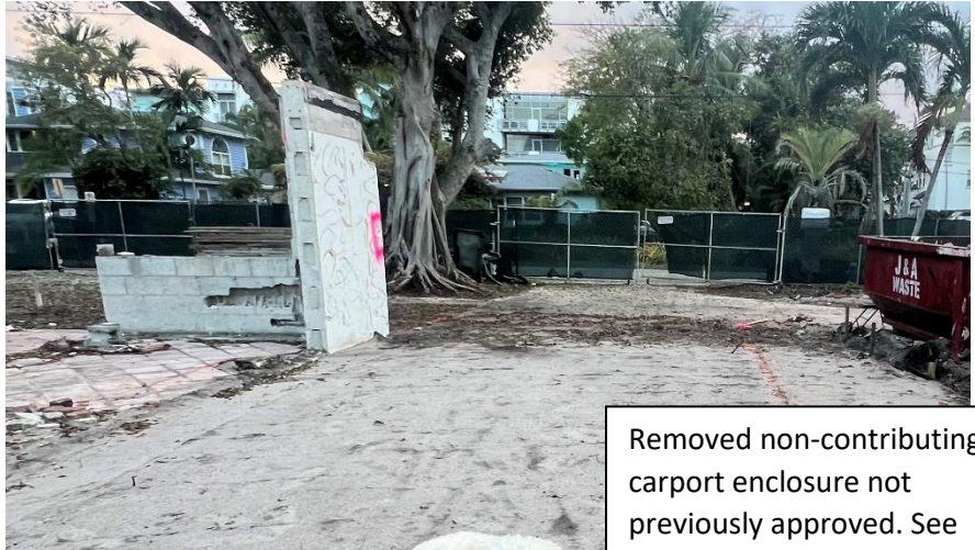
Removed non-contributing carport enclosure not previously approved. See Justification statement