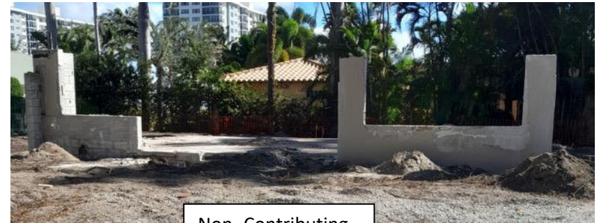
Non- Contributing Addition Removed