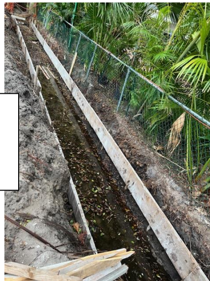
Footers formatted for South Retaining Wall to raise FEMA elevation