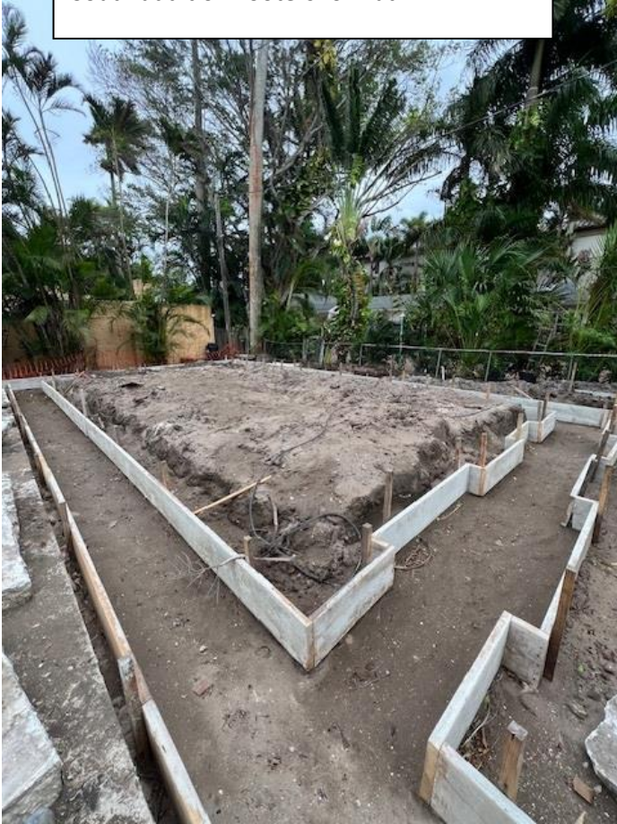
South addition Footers format