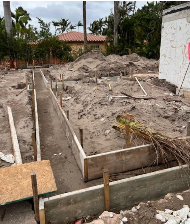
Northwest Area Garage Footers format