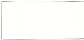
BENJAMIN MOORE GLACIER WHITE #AC-40

COLUMNS, BANDING, FASCIA, OUTLOOKERS / BRACKETS