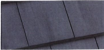
EAGLE ROOF TILE BEL-AIR #4549 SANTA PAULA (COLOR THRU)