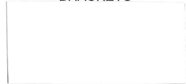
BENJAMIN MOORE BRILLIANT WHITE

COLUMNS, BANDING, FASCIA, OUTLOOKERS / BRACKETS