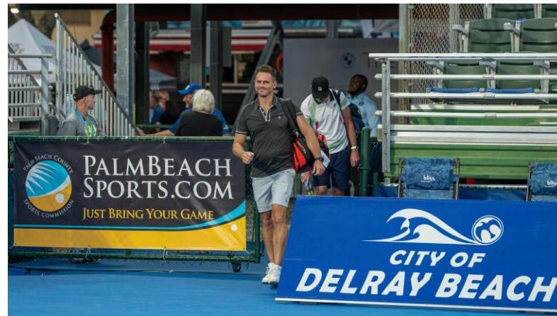
Stadium Lower Level Signage