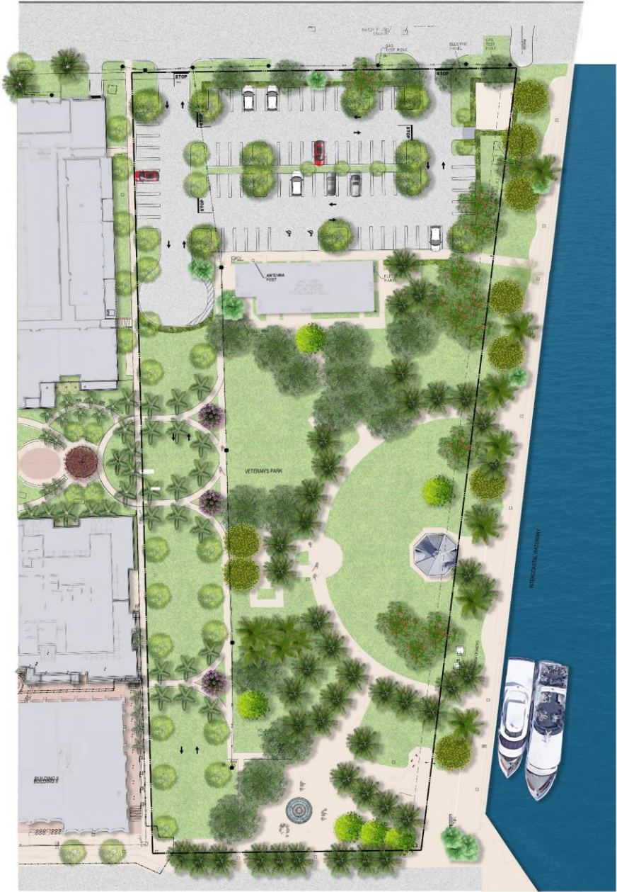
ATLANTIC CROSSING PHASE II SITE- DELRAY BEACH, FLORIDA