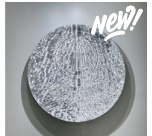
Infinity Squared Andreas Nottebohm