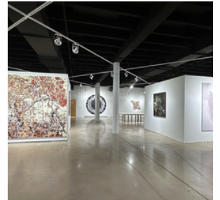
Marmoris Group Exhibition