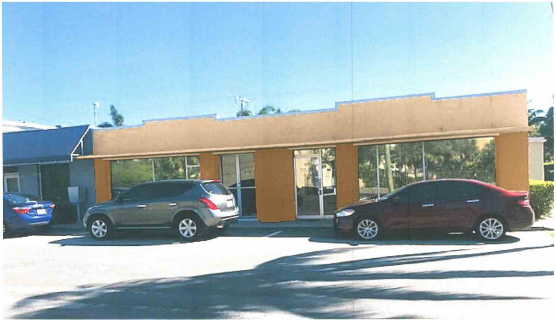
N260-2 Almond Latte