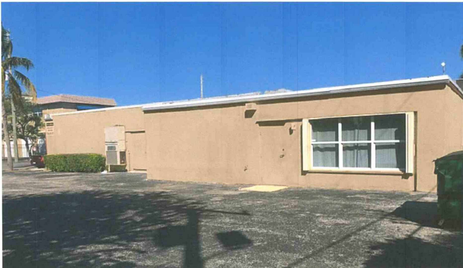
N260-2 Almond Latte