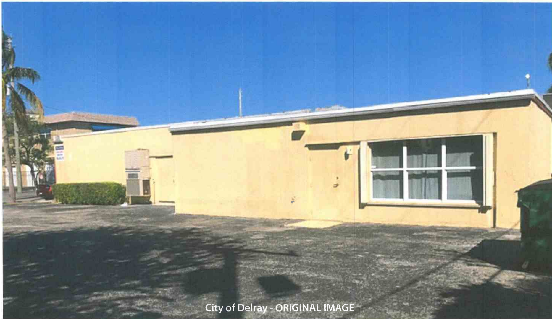
City of Delray - ORIGINAL IMAGE