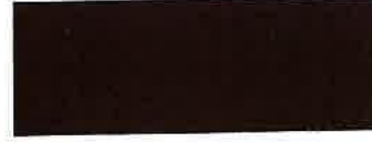
Burgundy SMP SR .24 TE .83 SRI 21