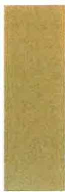
Mocha Tan SMP SR .44 TE .84 SRI 48