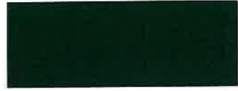
Forest Green SMP SR .31 TE .85 SRI 31