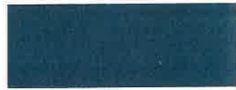
Hawaiian Blue SMP SR .32 TE .85 SRI 32