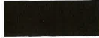
Bronze SMP SR .30 TE .85 SRI 30