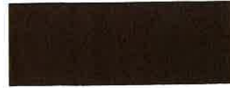
Cocoa Brown SMP SR .32 TE .85 SRI 32