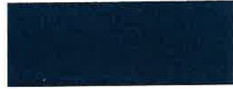
Gallery Blue SMP SR .25 TE .86 SRI 24