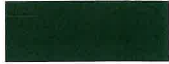
Evergreen SMP SR .27 TE .86 SRI 26