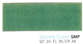
Manne Green SMP SR .36 TE .86 SRI 38