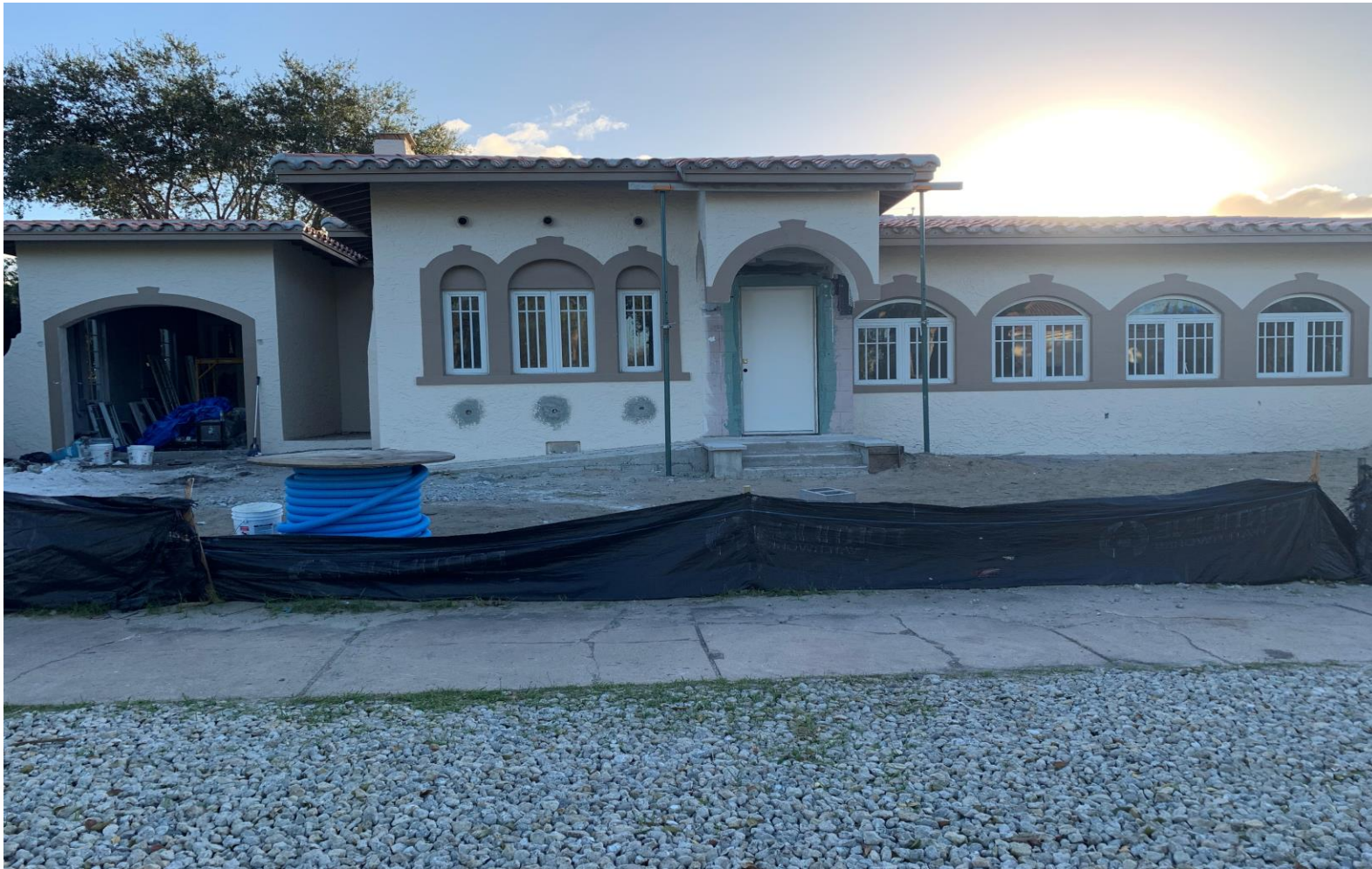
February 3, 2022 view