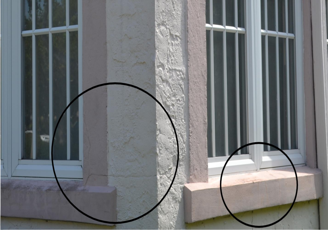
Before- Cracked and leaking