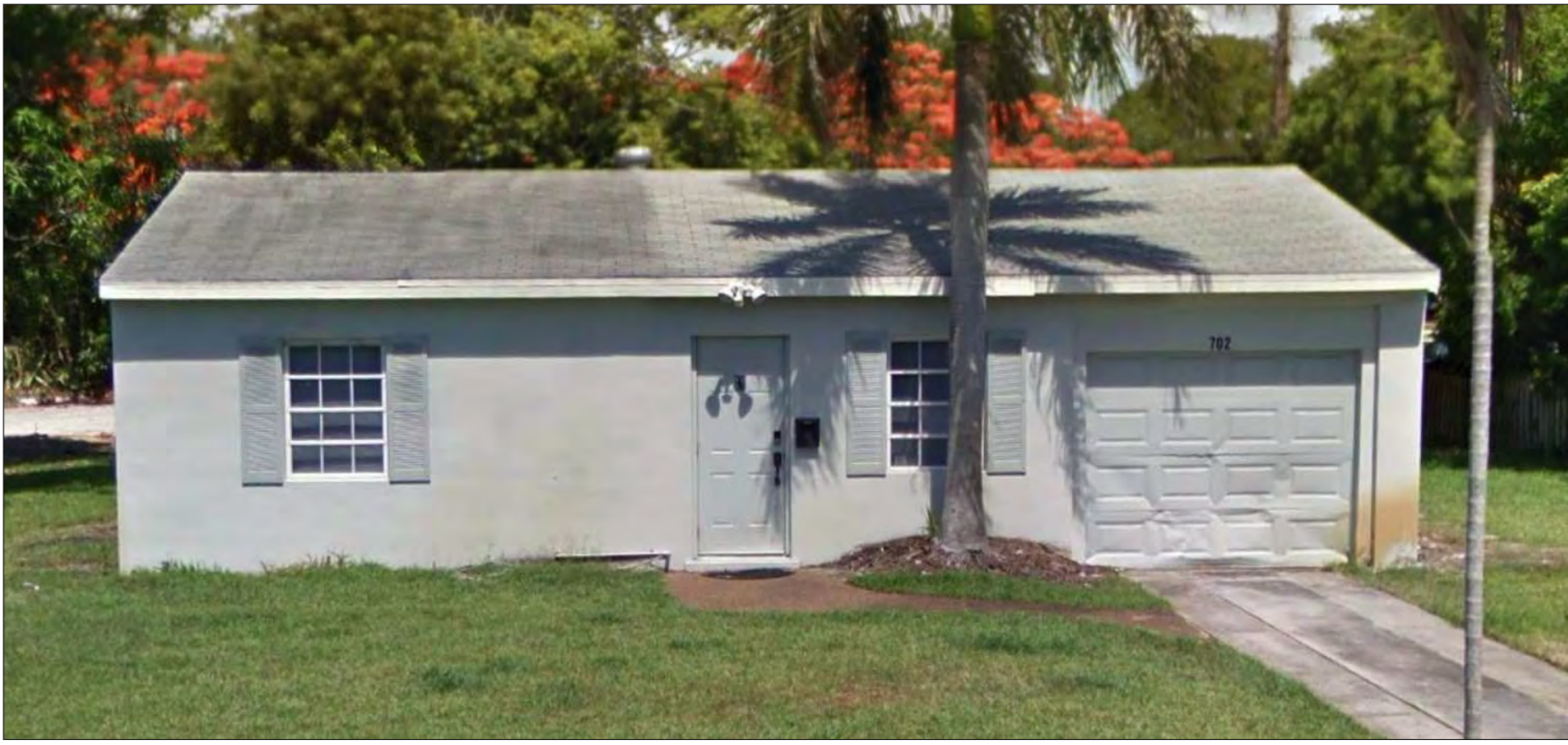
1 BUILDING SECTION SCALE: 1:1.09