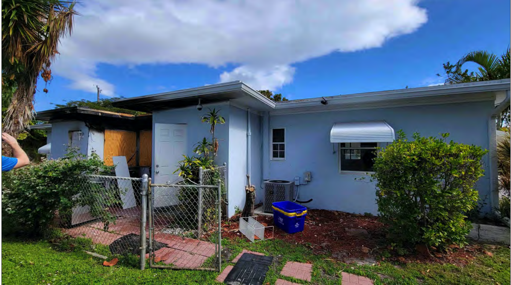
EXISTING CONDITIONS SCALE: 1:6.32