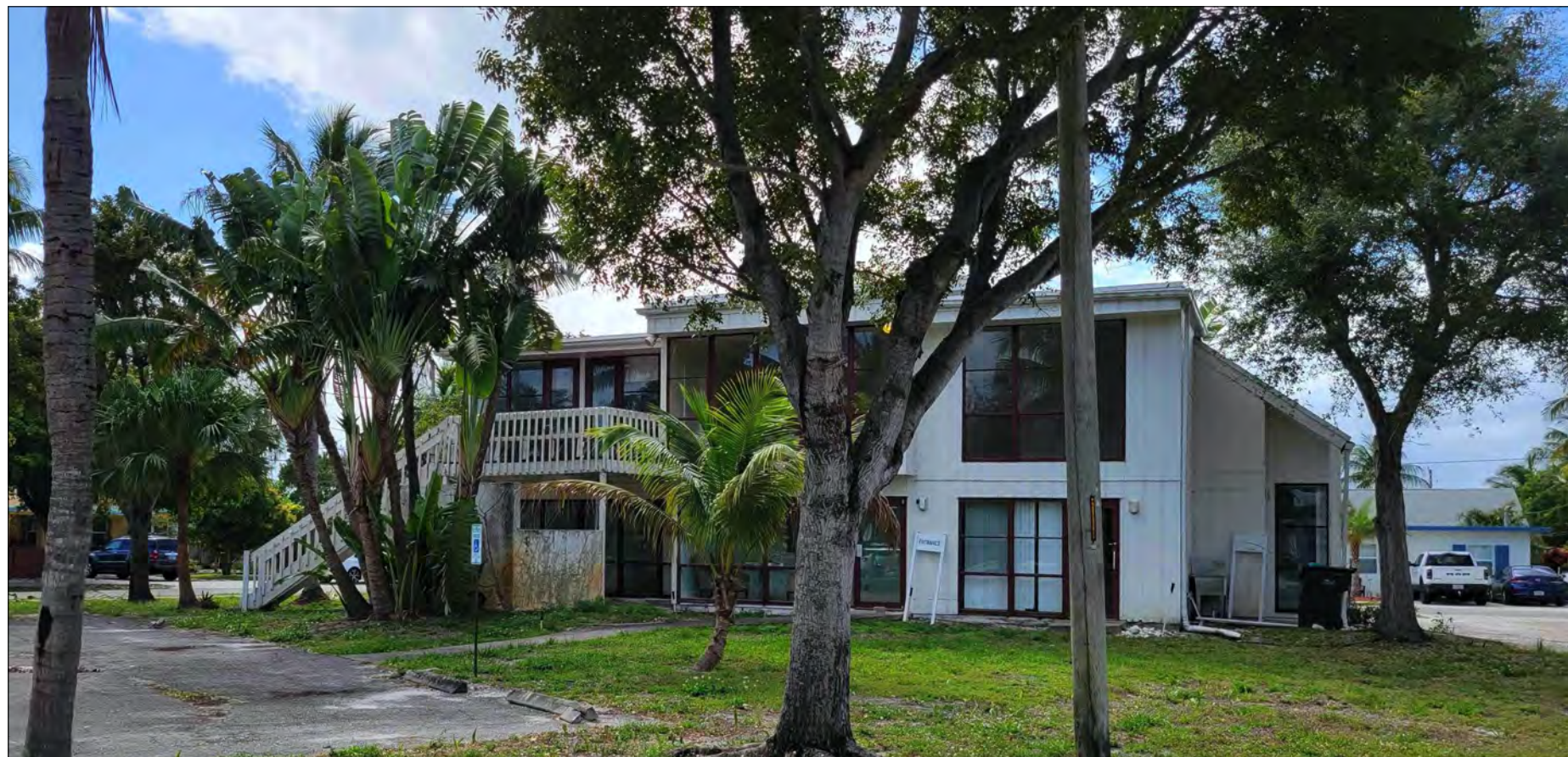
4 BUILDING SECTION SCALE: 1:5.35