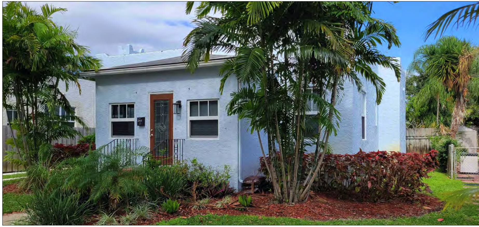
2 BUILDING SECTION SCALE: 1:5.35