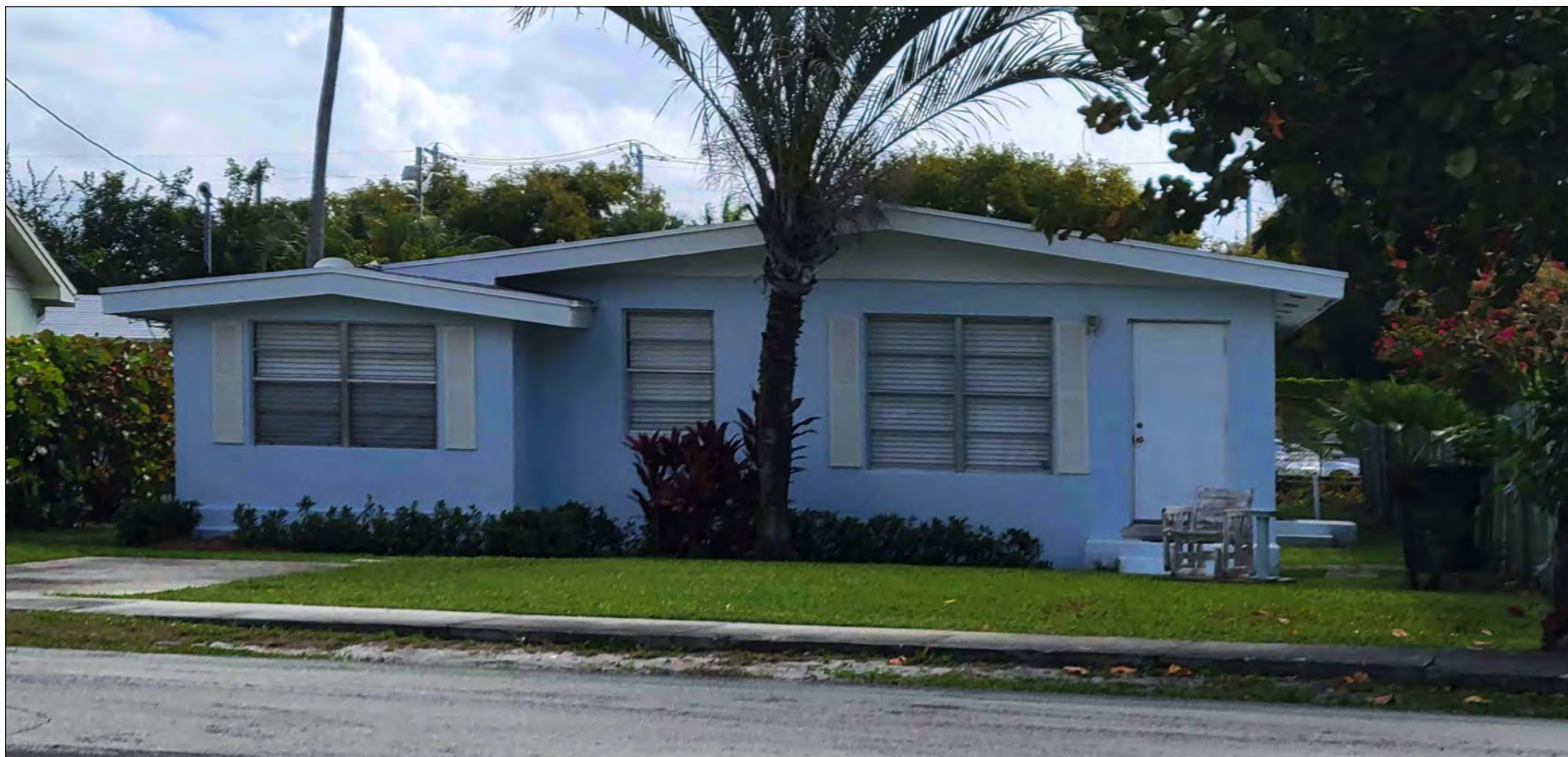
5 BUILDING SECTION SCALE: 1:5.35