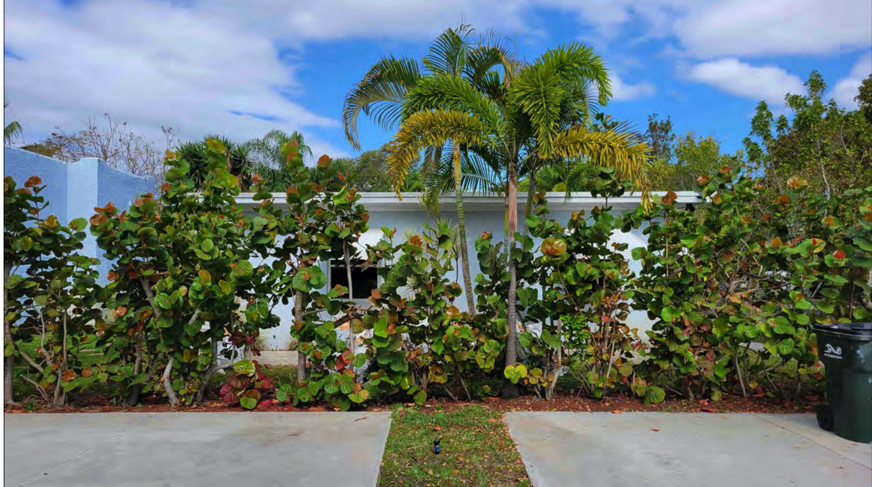
EXISTING CONDITIONS SCALE: 1:6.32