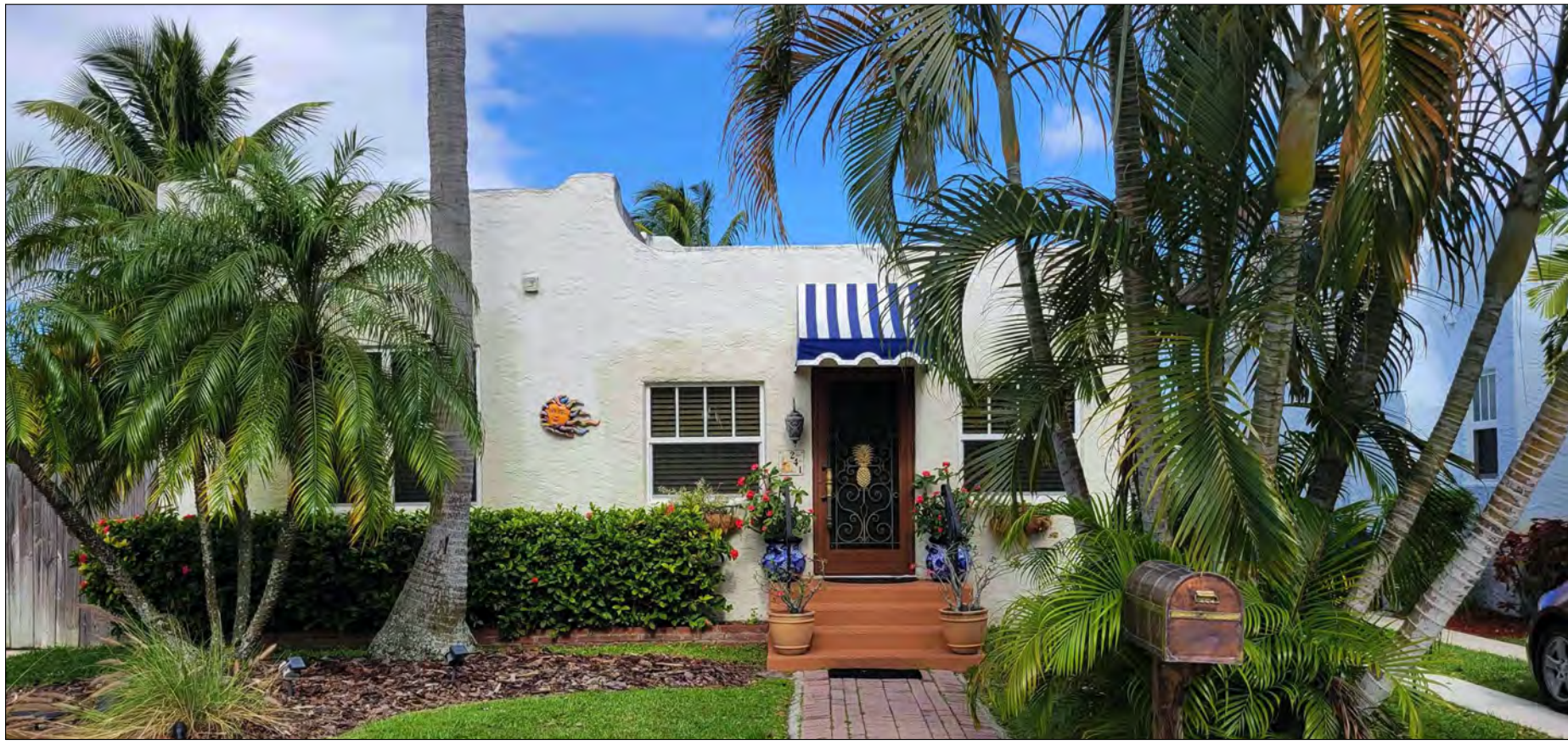
3 BUILDING SECTION SCALE: 1:5.35