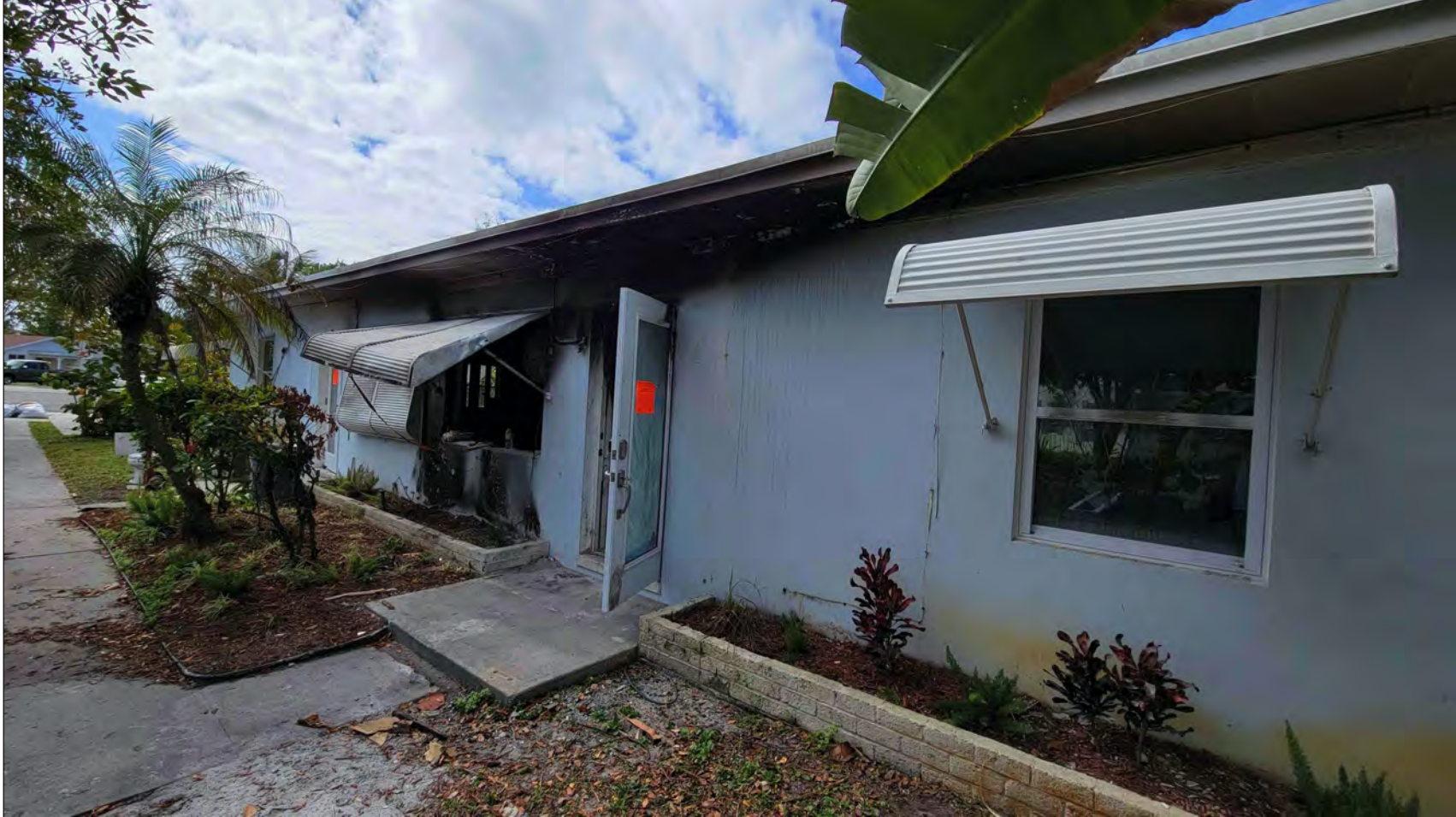
EXISTING CONDITIONS SCALE: 1:6.32