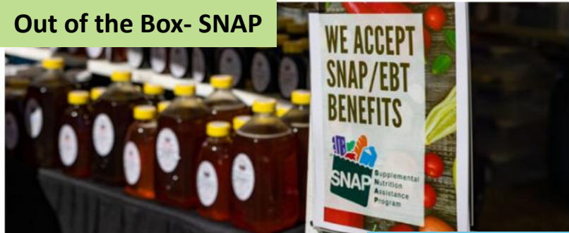
Out of the Box- SNAP