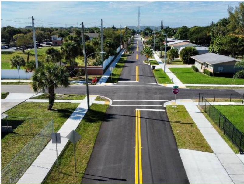
Capital Project Infrastructure - SW Neighborhood Project