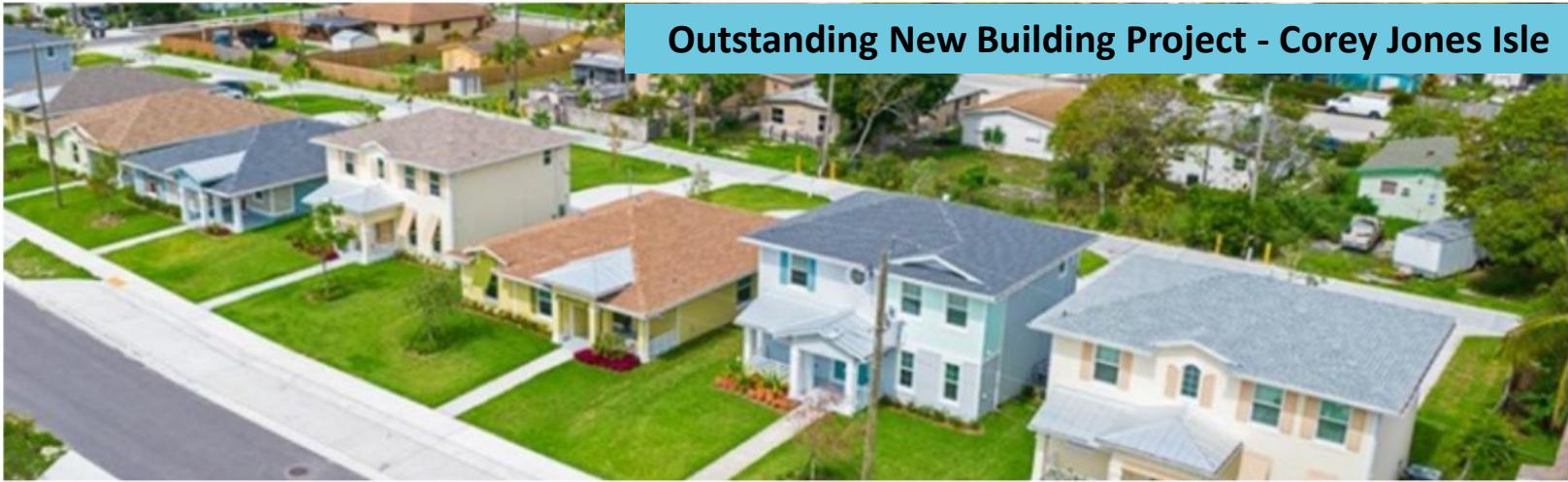
Outstanding New Building Project - Corey Jones Isle