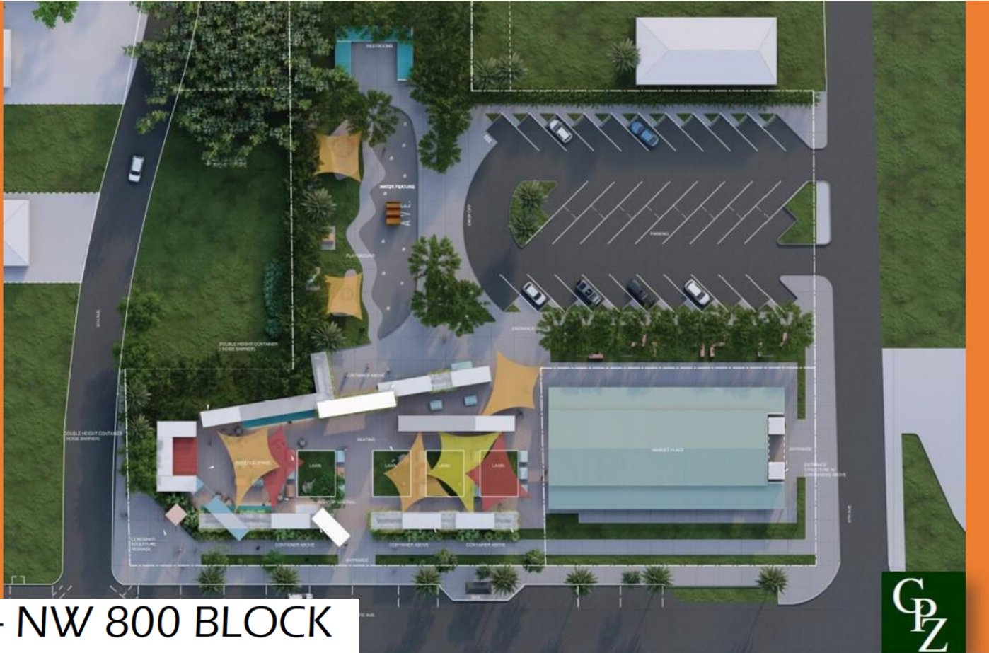
- NW 800 BLOCK REDEVELOPMENT PROJECT