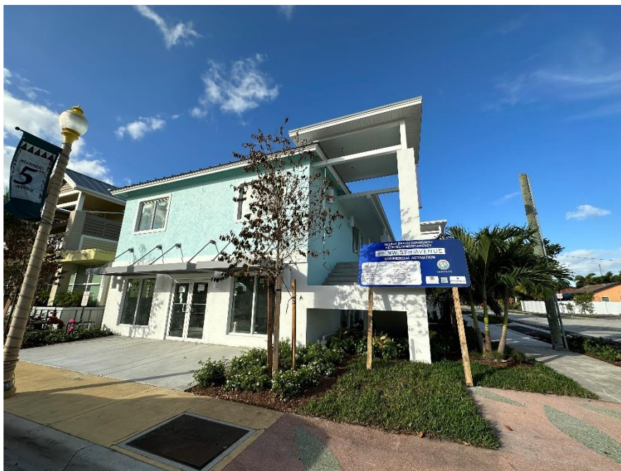
View on NW 5 th Avenue

Fully Furnished, Open Work Areas, Conference Rooms, Restrooms, Office Suites, Private Telephone Booths