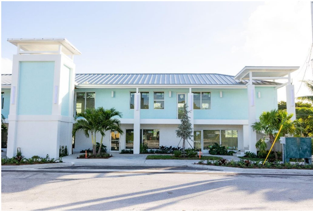
View on NW 1 st Street