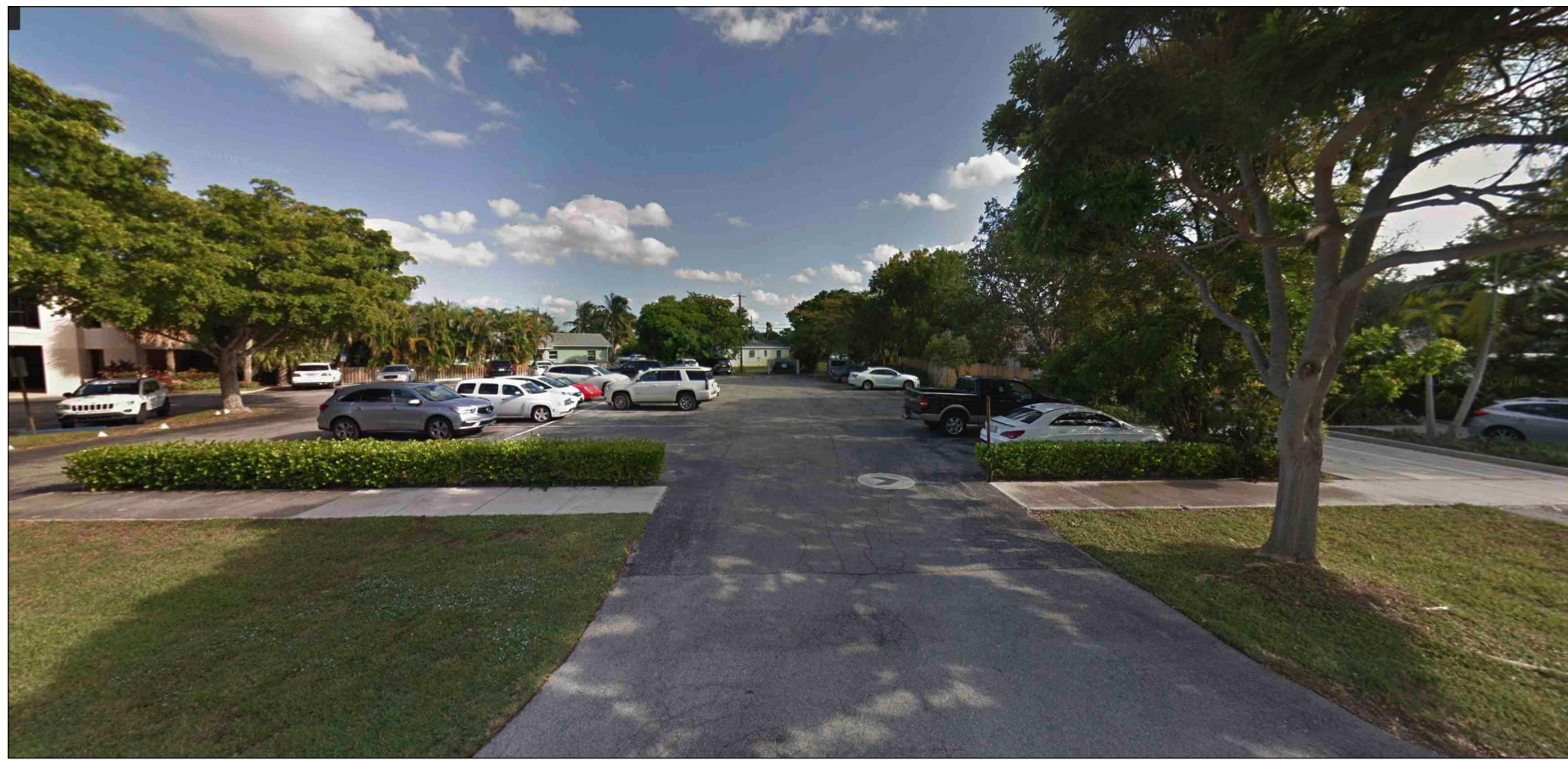
4 ADJACENT PROPERTY SCALE: 1:2.53