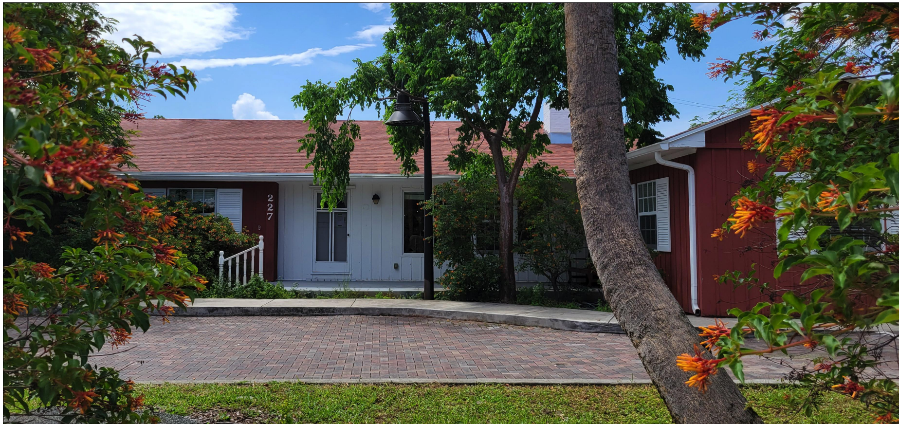
3 ADJACENT PROPERTY SCALE: 1:5.35