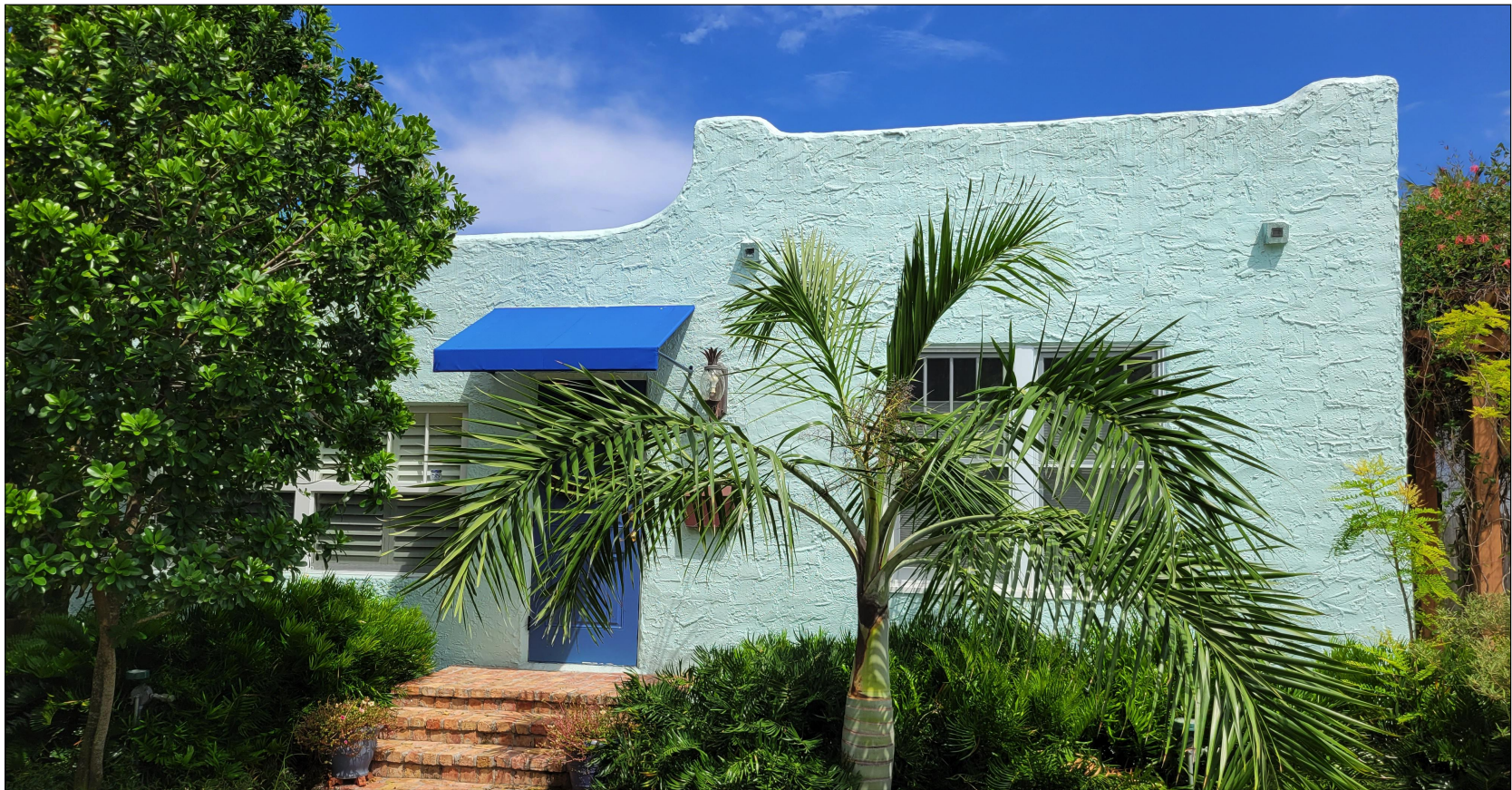
2 ADJACENT PROPERTY SCALE: 1:6.45