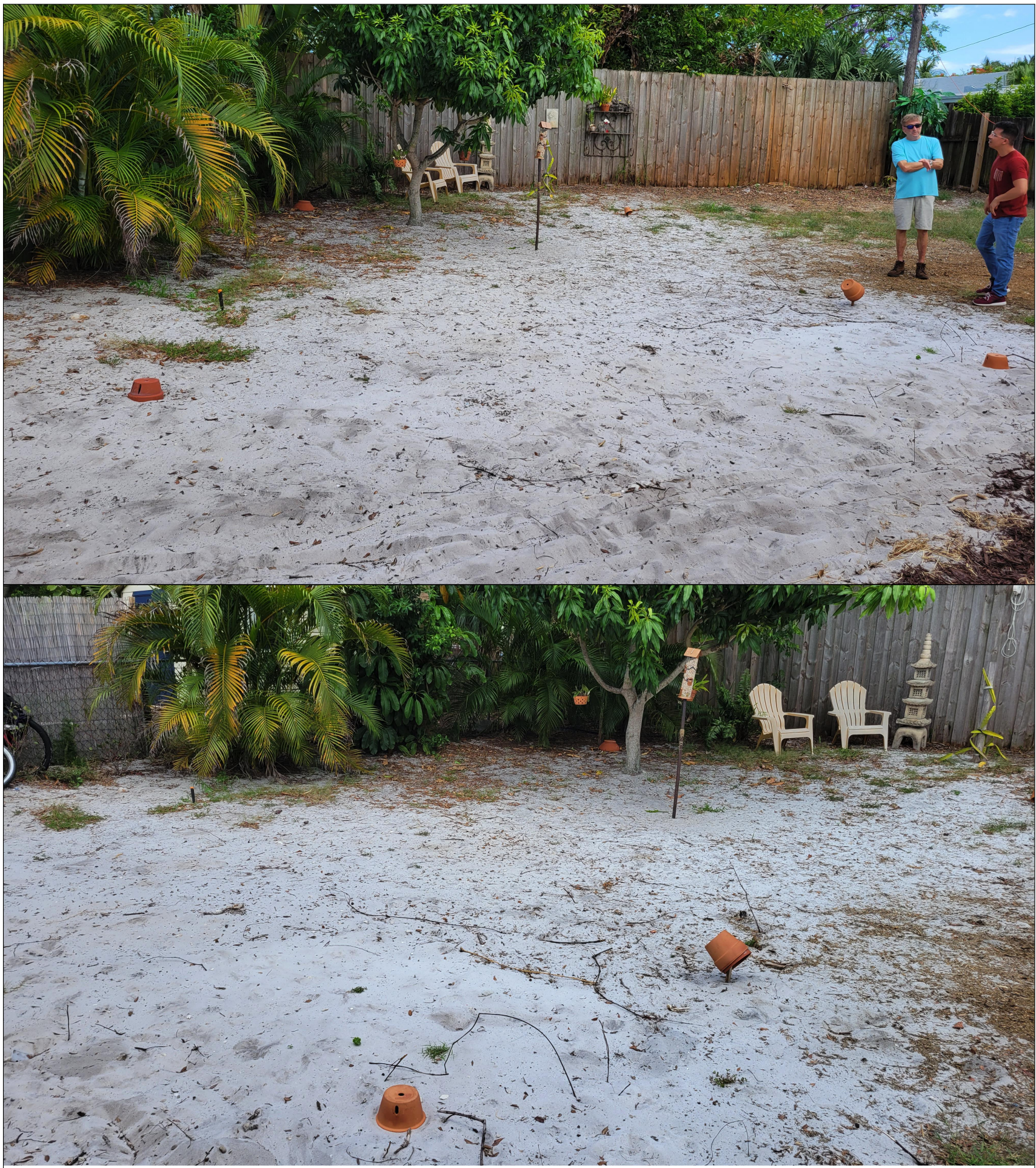
EXISTING CONDITIONS SCALE: 1:6.32

Volumes/SSA Projects/Active Projects/22-443 240 N Dixie Blvd. Delray Beach, fl (Tim McKinney)/22-443 240 N Dixie Blvd. Delray Beach, fl (Tim McKinney).pin