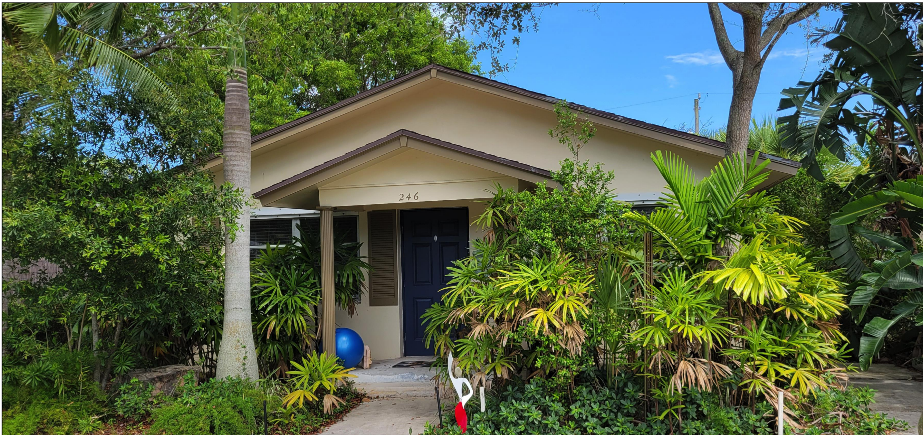
1 ADJACENT PROPERTY SCALE: 1:5.20