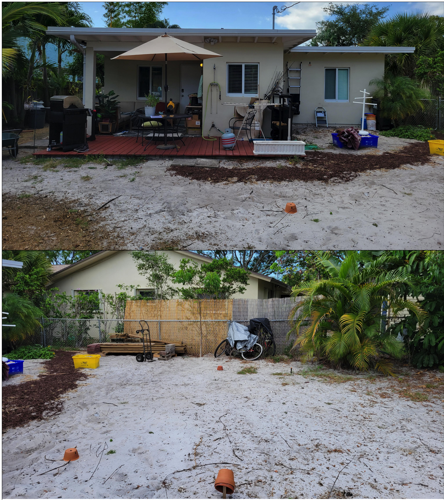
EXISTING CONDITIONS SCALE: 1:6.32