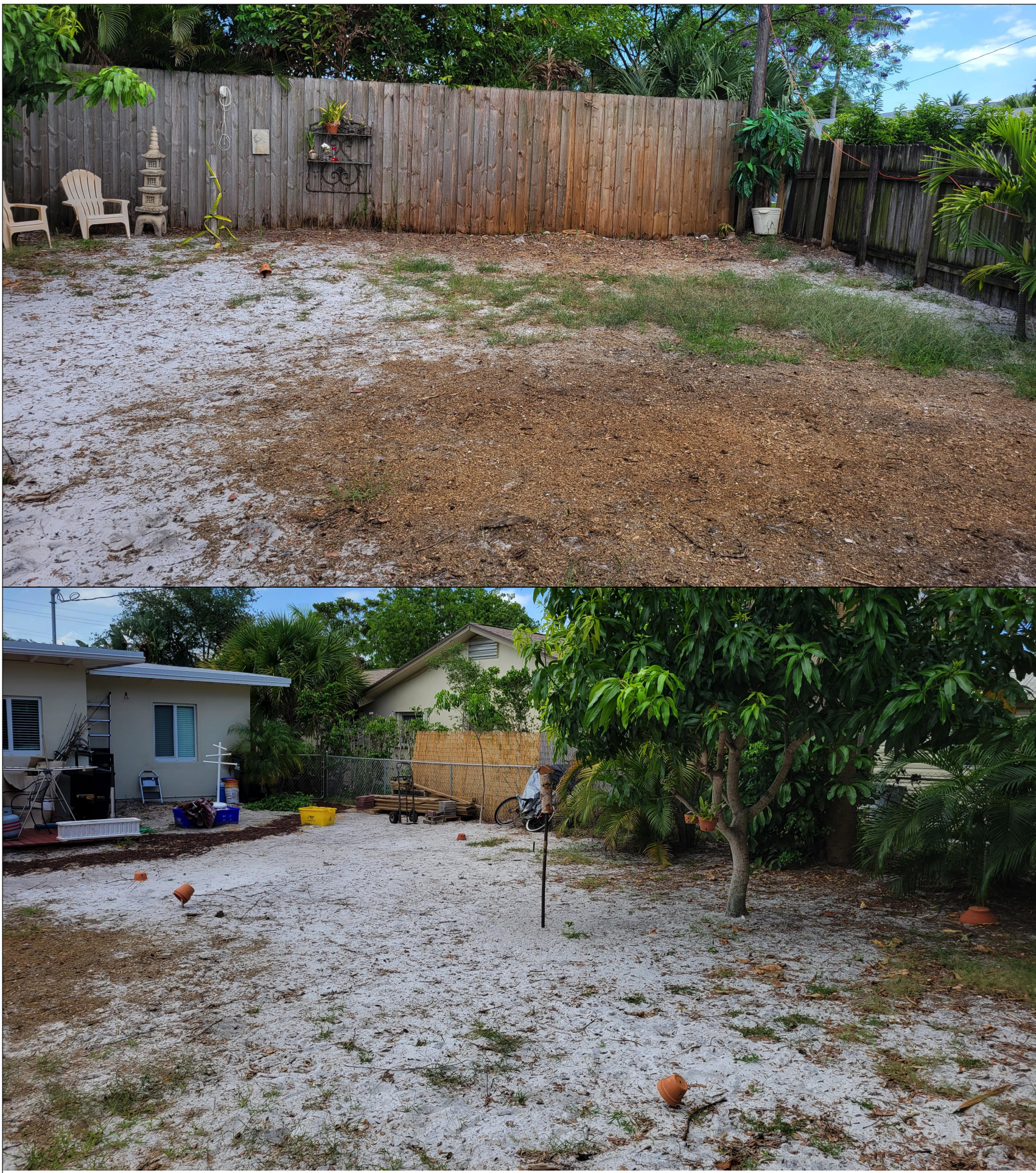
EXISTING CONDITIONS SCALE: 1:6.32