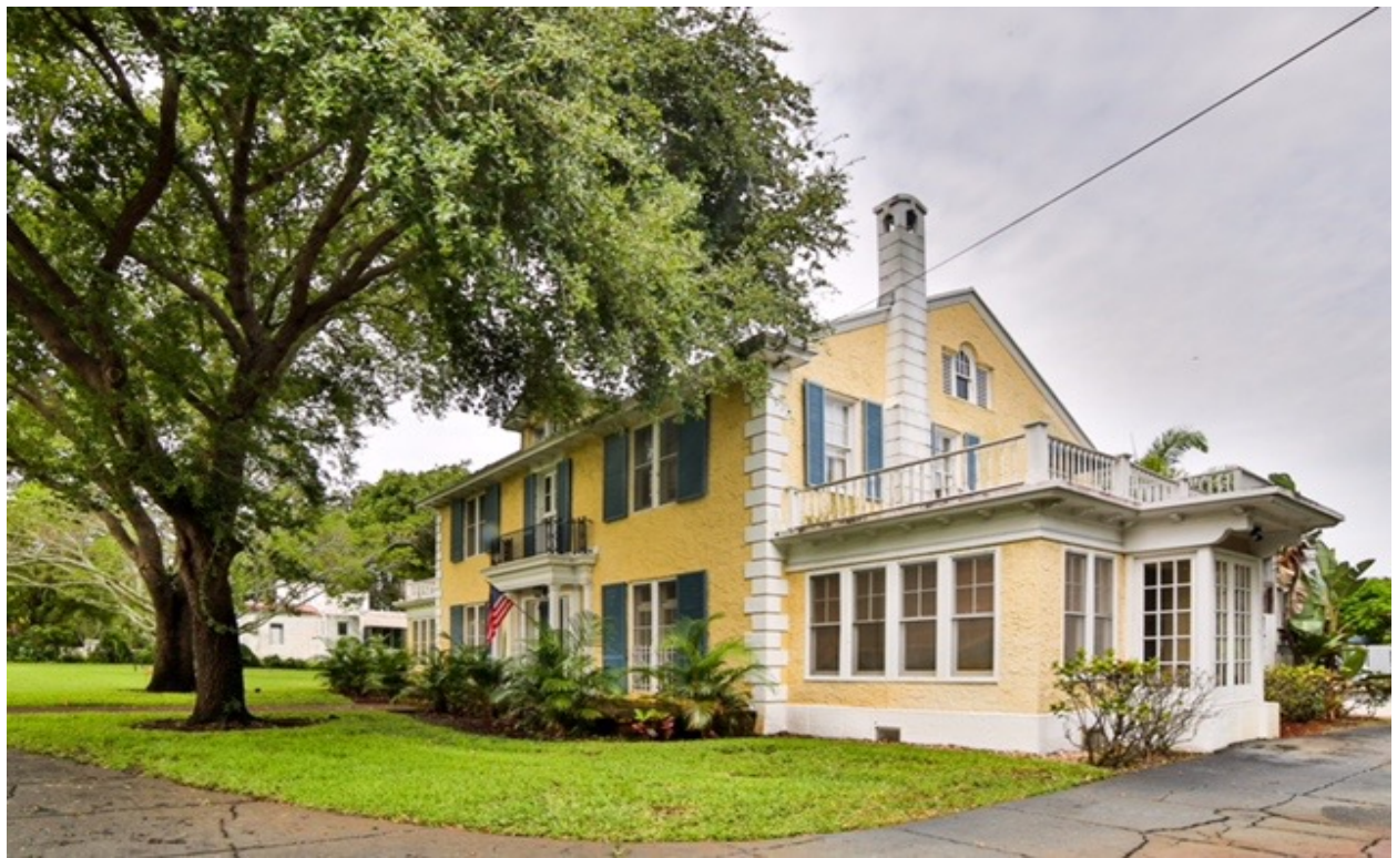
North side view