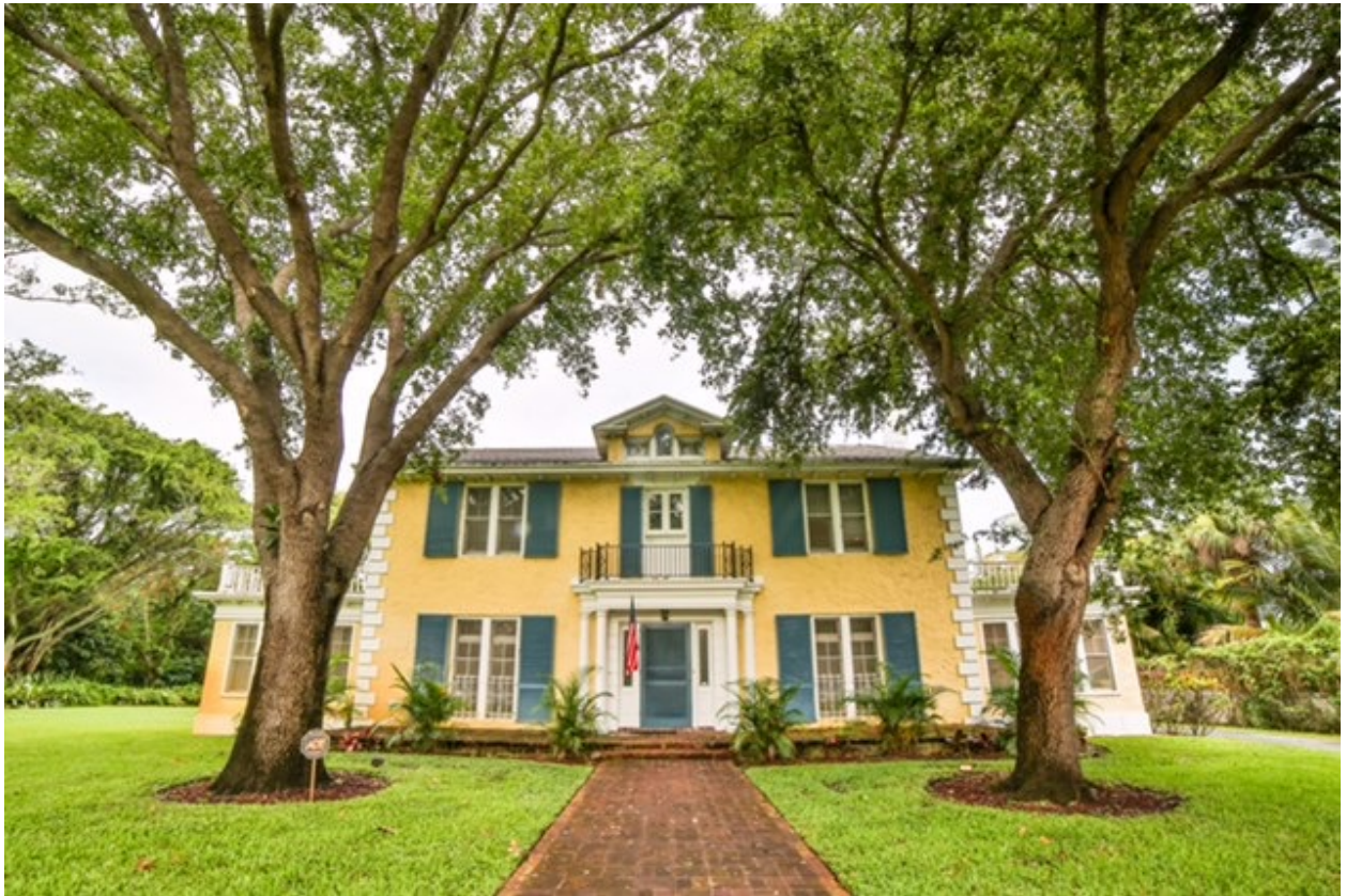
THE CLINT MOORE HOUSE 1420 North Swinton Avenue Delray Beach, Florida 33444