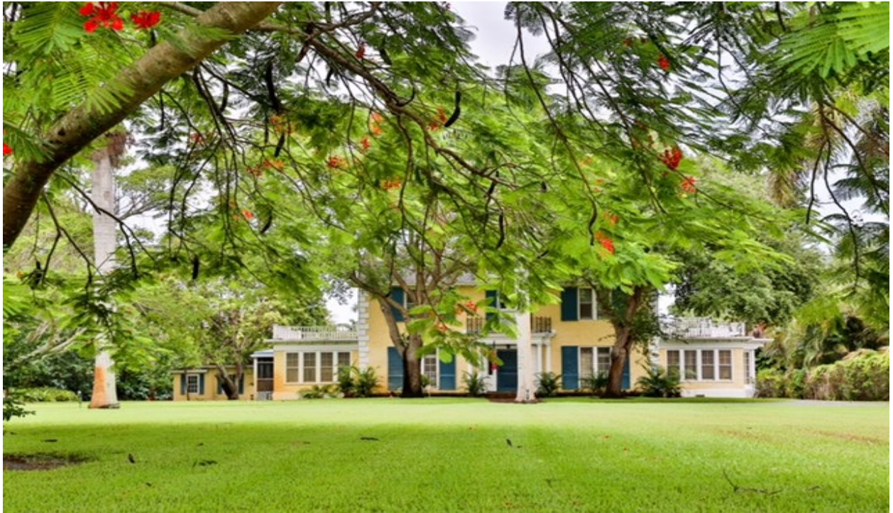
Royal Poinciana accents residence