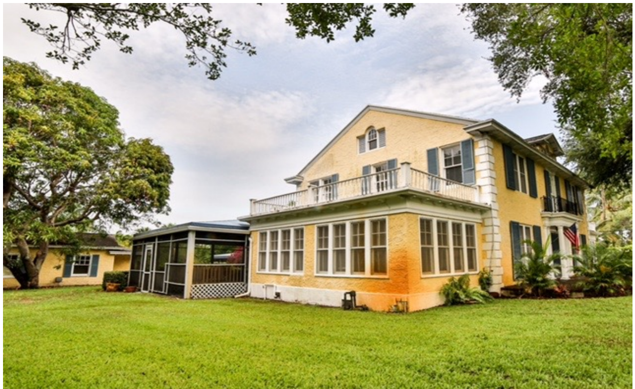
South side view