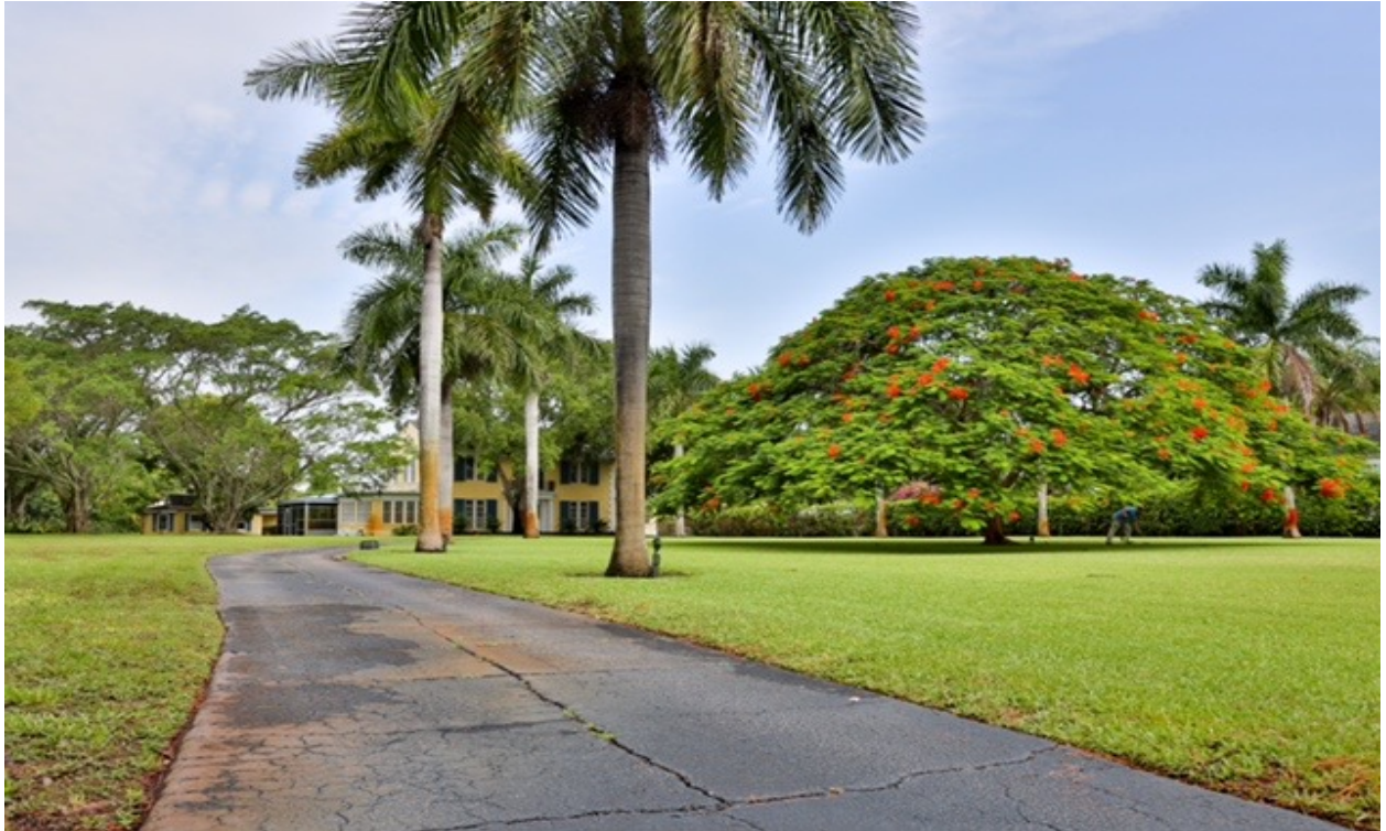
Expansive drive to residence