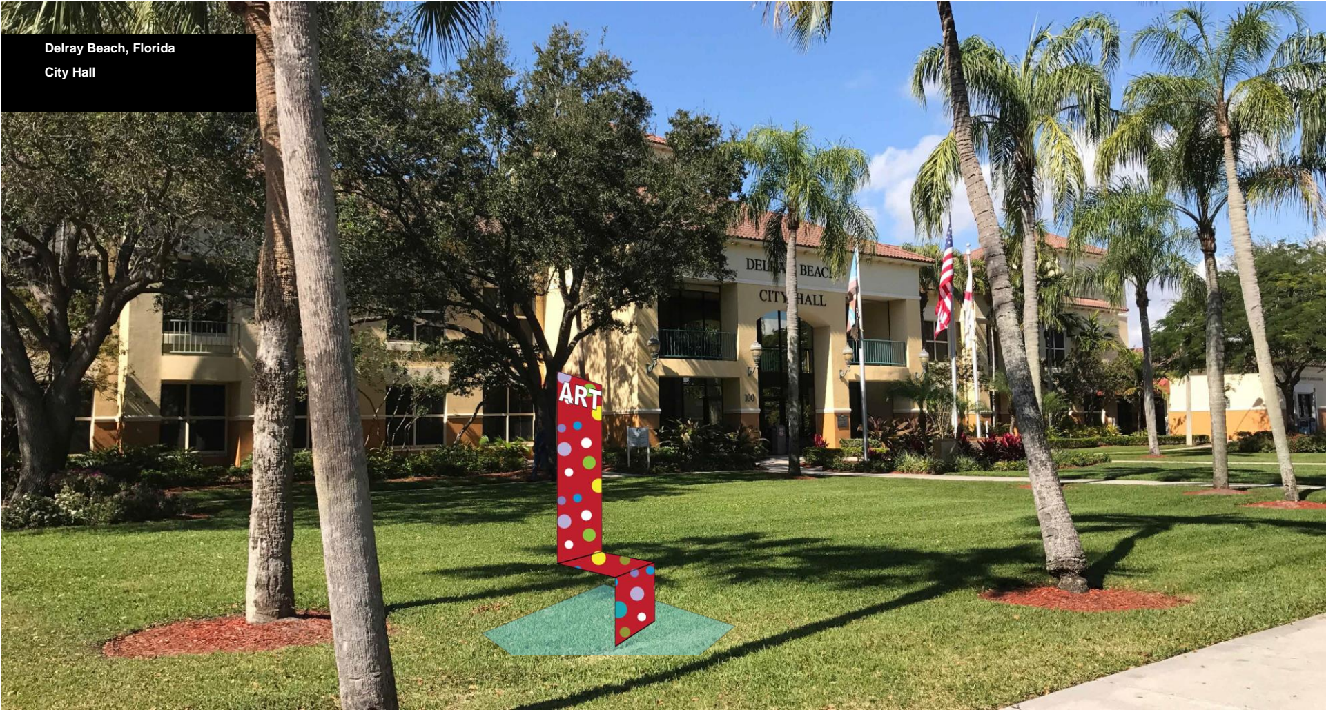
Delray Beach, Florida City Hall