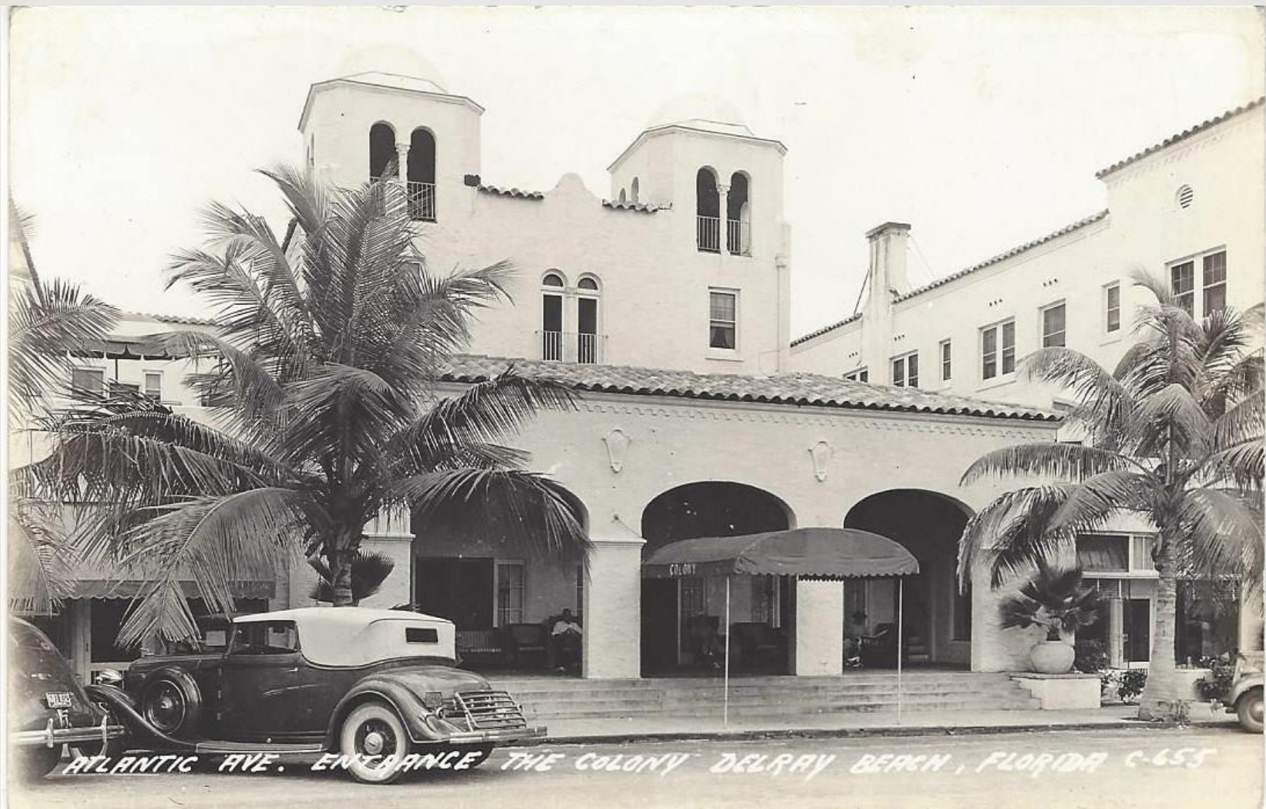
ATLANTIC AVE. ENTRANCE THE COLONY DELRAY BEACH, FLORIDA C-655