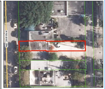
AERIAL PHOTOGRAPH (MAY NOT SHOW LATEST IMPROVEMENTS) (NOT-TO-SCALE)

— BOUNDARY LINE — BUILDING LINE - - - CENTERLINE - - - EASEMENT LINE x x x CHAIN LINK FENCE // // // WOODEN FENCE | | | OVERHEAD CABLE ENCROACHMENTS SHOWN IN RED LETTERING