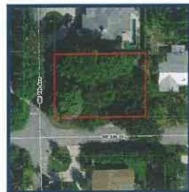
AERIAL PHOTOGRAPH (NOT-TO-SCALE)