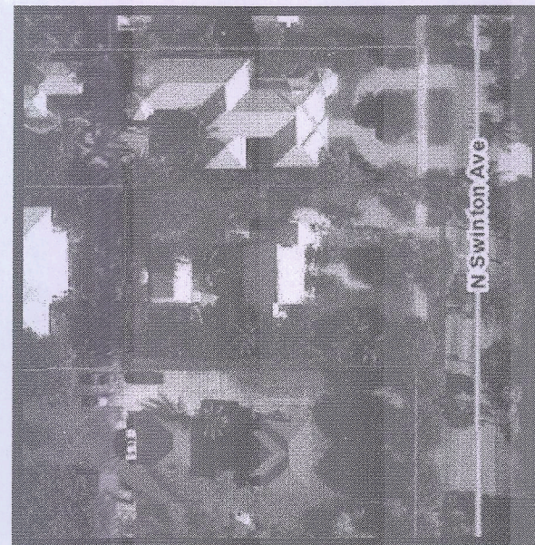
AERIAL PHOTOGRAPH (NOT-TO-SCALE)