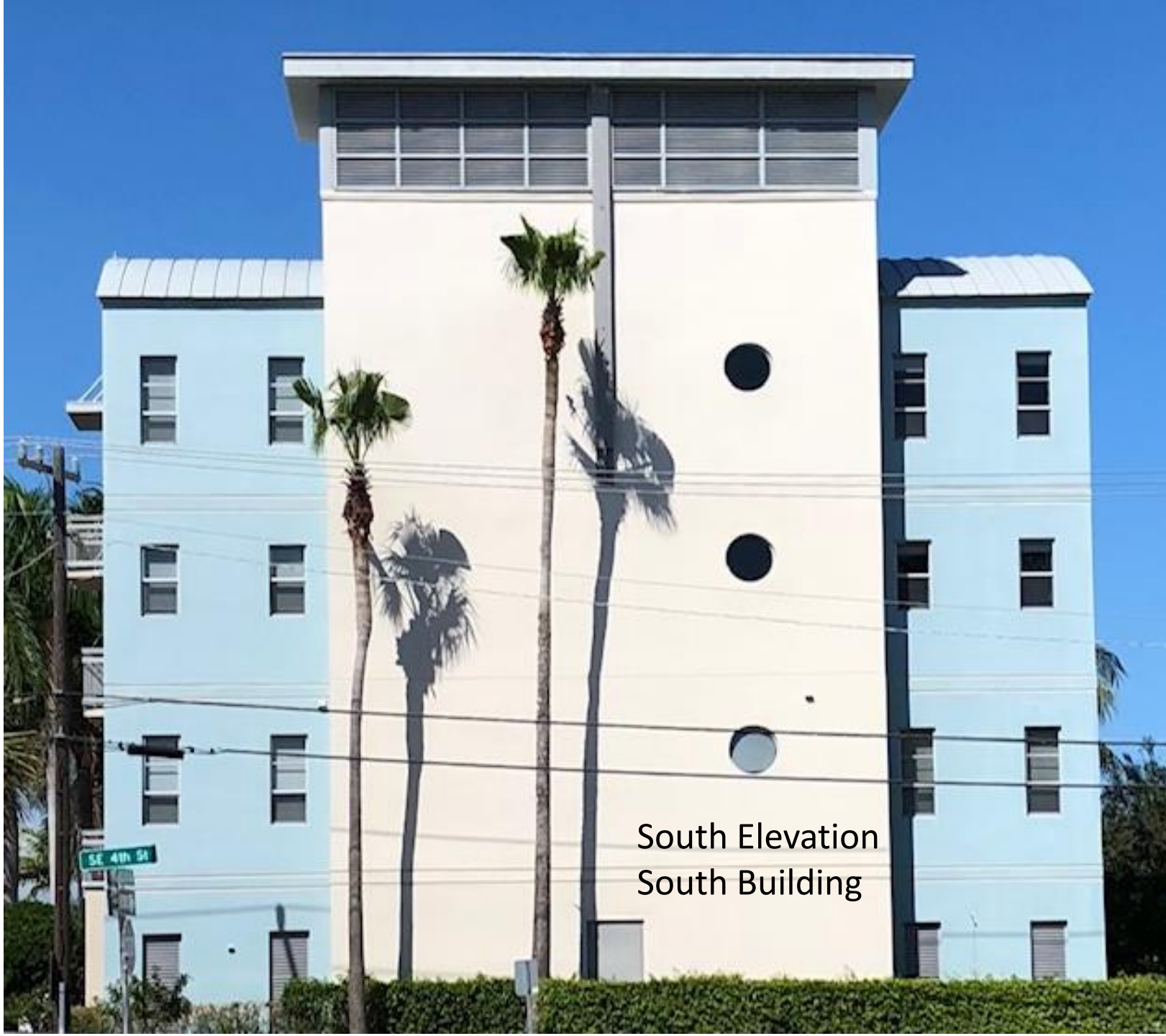
South Elevation South Building