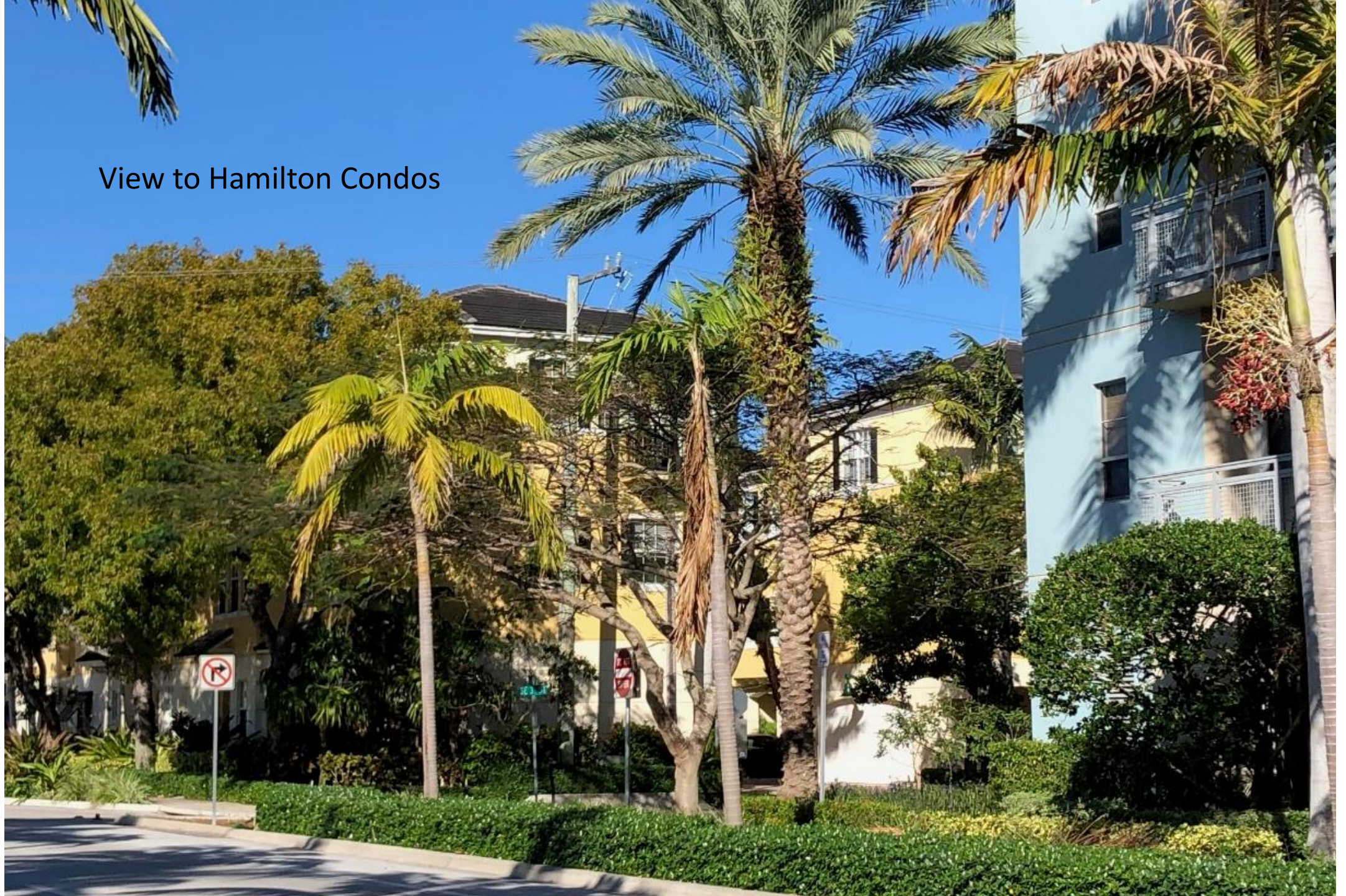
View to Hamilton Condos