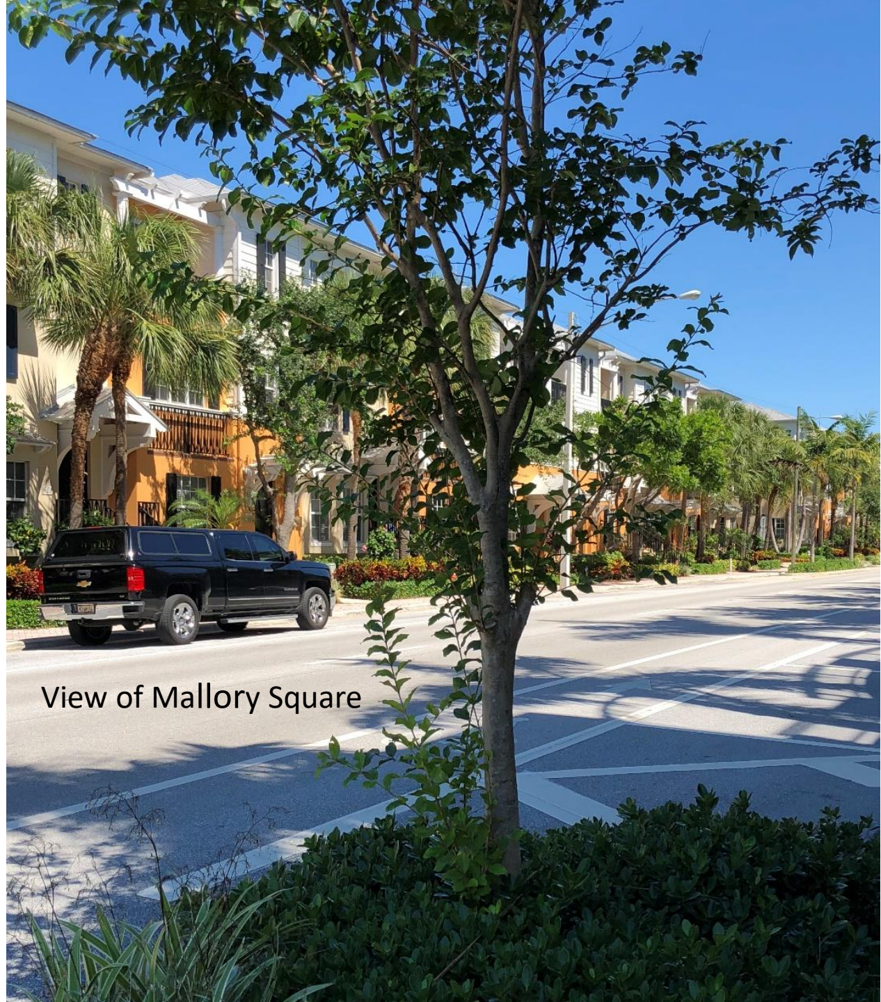
View of Mallory Square