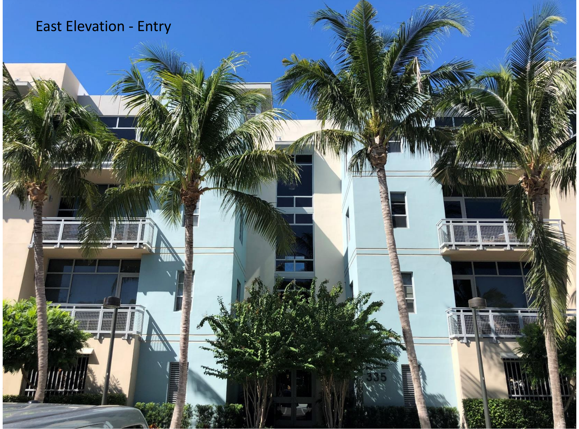
East Elevation - Entry