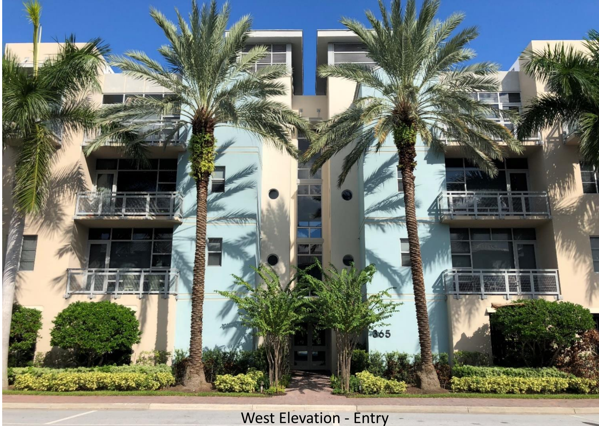
West Elevation - Entry