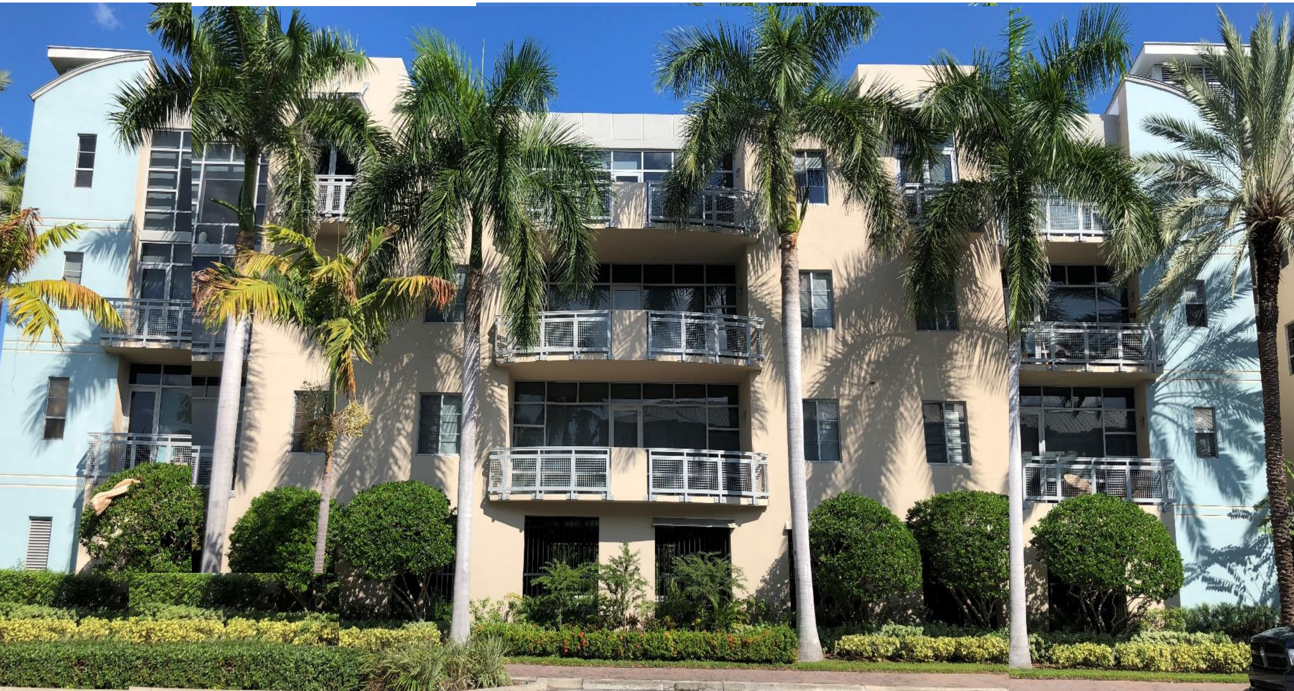
West Elevation – Half North Building