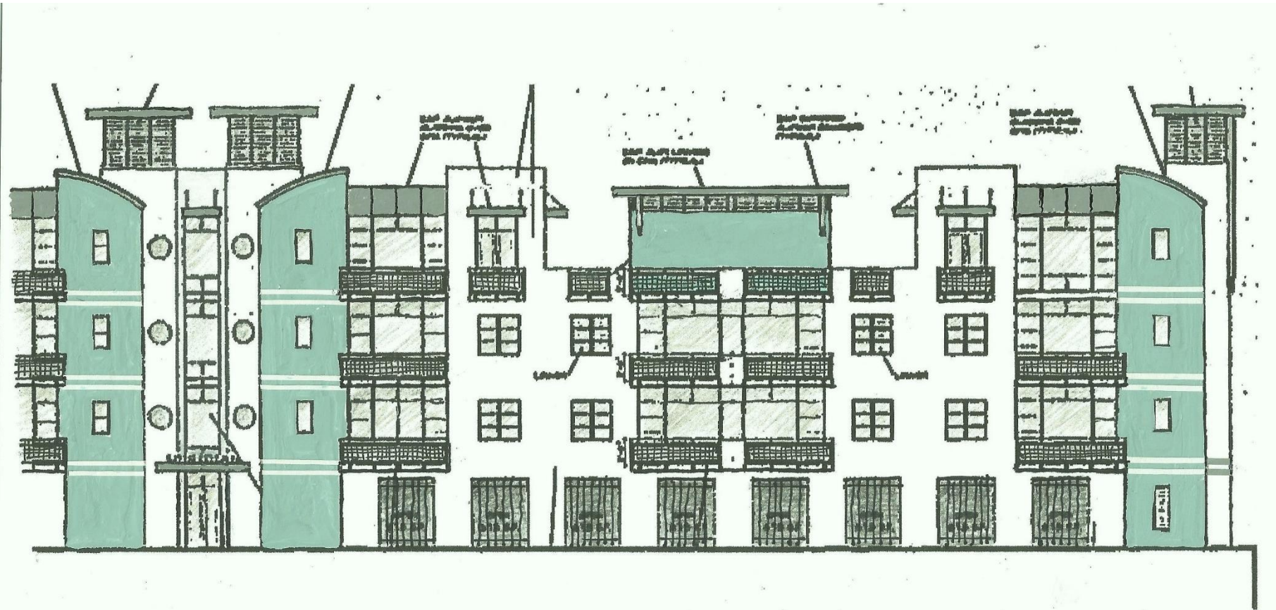
Proposed Colors Typical East and West Half Elevations