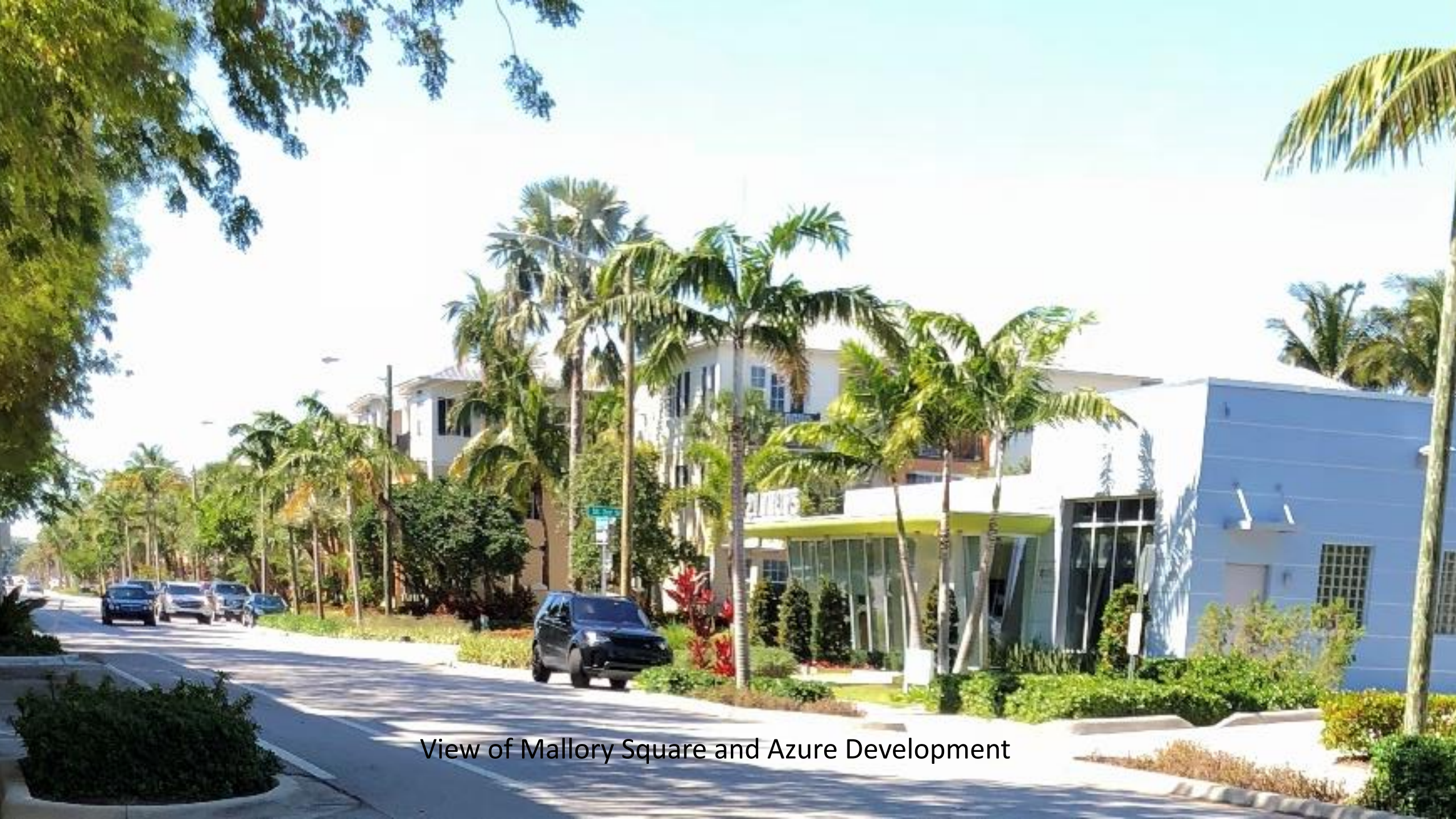
View of Mallory Square and Azure Development