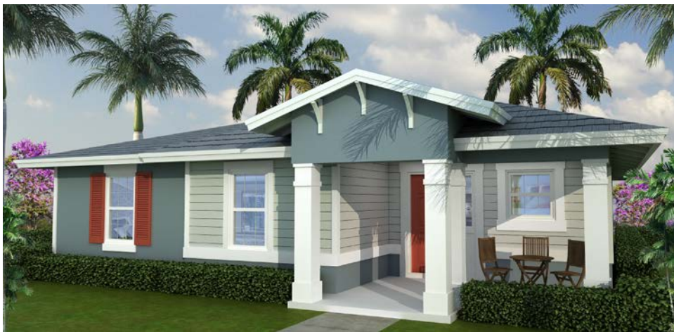
MODEL A – ELEVATION 2