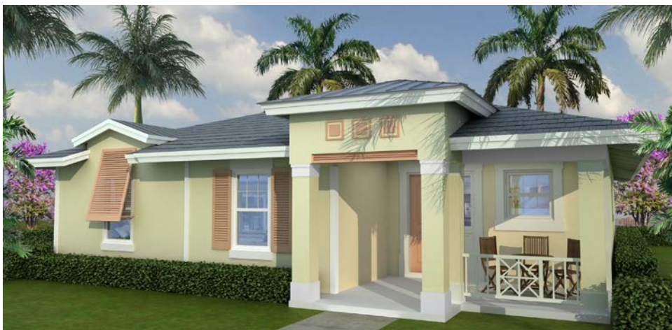
MODEL A – ELEVATION 3