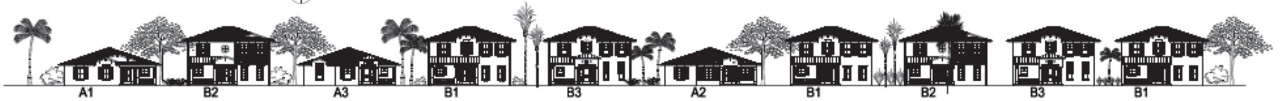
PROPOSED STREET ELEVATION SCALE 1" = 20'