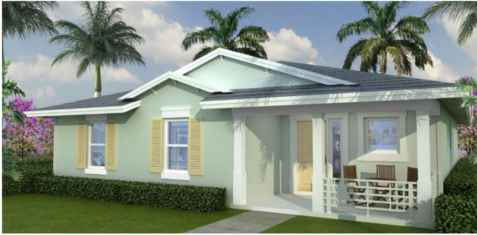
MODEL A – ELEVATION 1