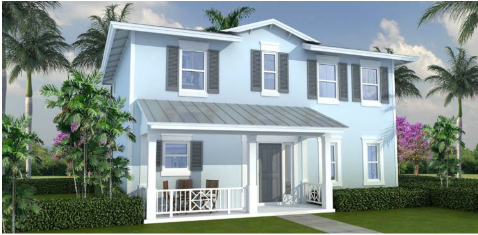
MODEL B – ELEVATION 1