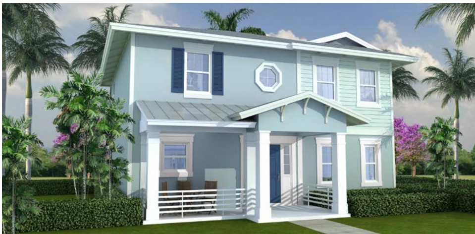
MODEL B – ELEVATION 2