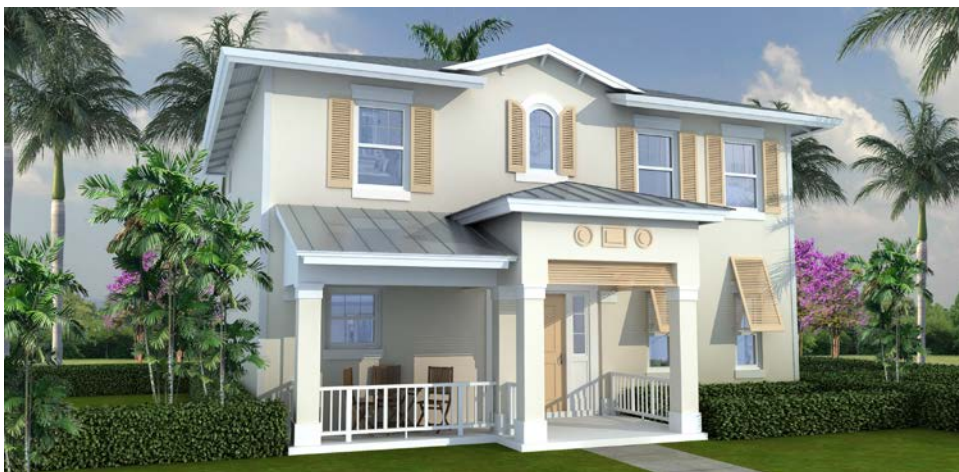
MODEL B – ELEVATION 3