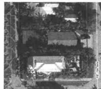
AERIAL PHOTOGRAPH (MAY NOT SHOW LATEST IMPROVEMENTS) (NOT-TO-SCALE)

BEARING REFERENCE: EAST LINE OF HAMILTON PLACE PLAT AS S. 01°08'35" E. ALL BEARINGS SHOWN HEREON REFERENCED THERETO.