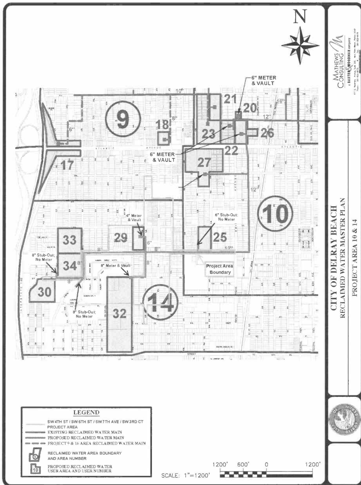
Revised Figure 4-5: Updated Area 14 Reclaimed Water Main Alignment