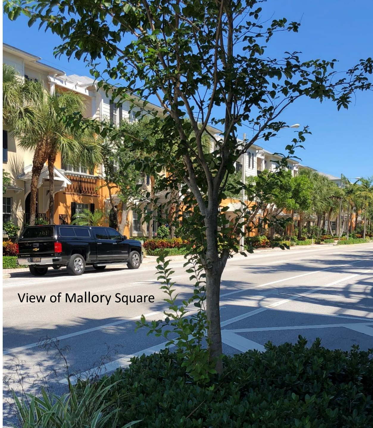
View of Mallory Square