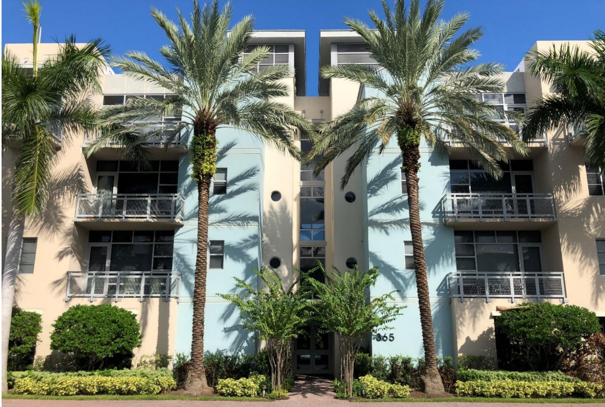
West Elevation - Entry