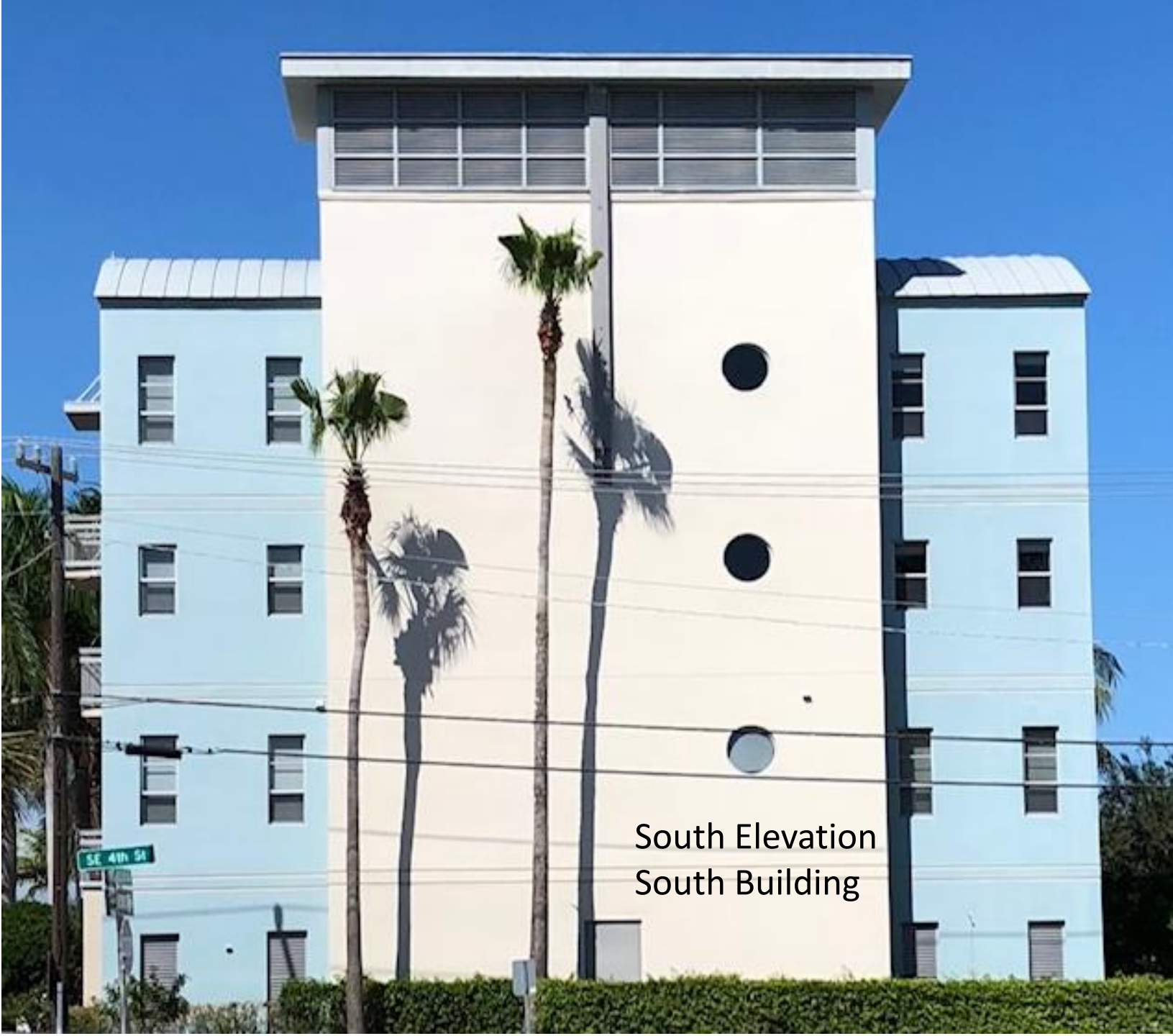
South Elevation South Building