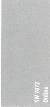
SW 7072 Online