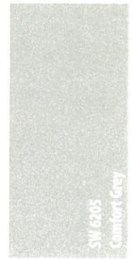
SW 7006 Extra White