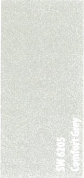
SW 7006 Extra White