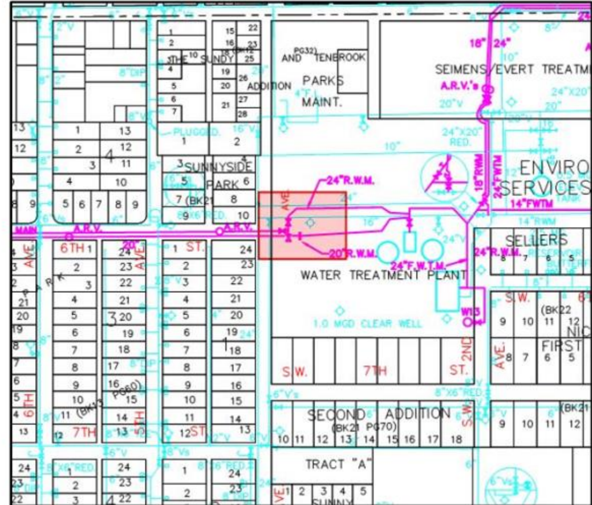
# T-4.2 WTP, SW 4 th Ave Raw Water Watermain Piping System to Plant