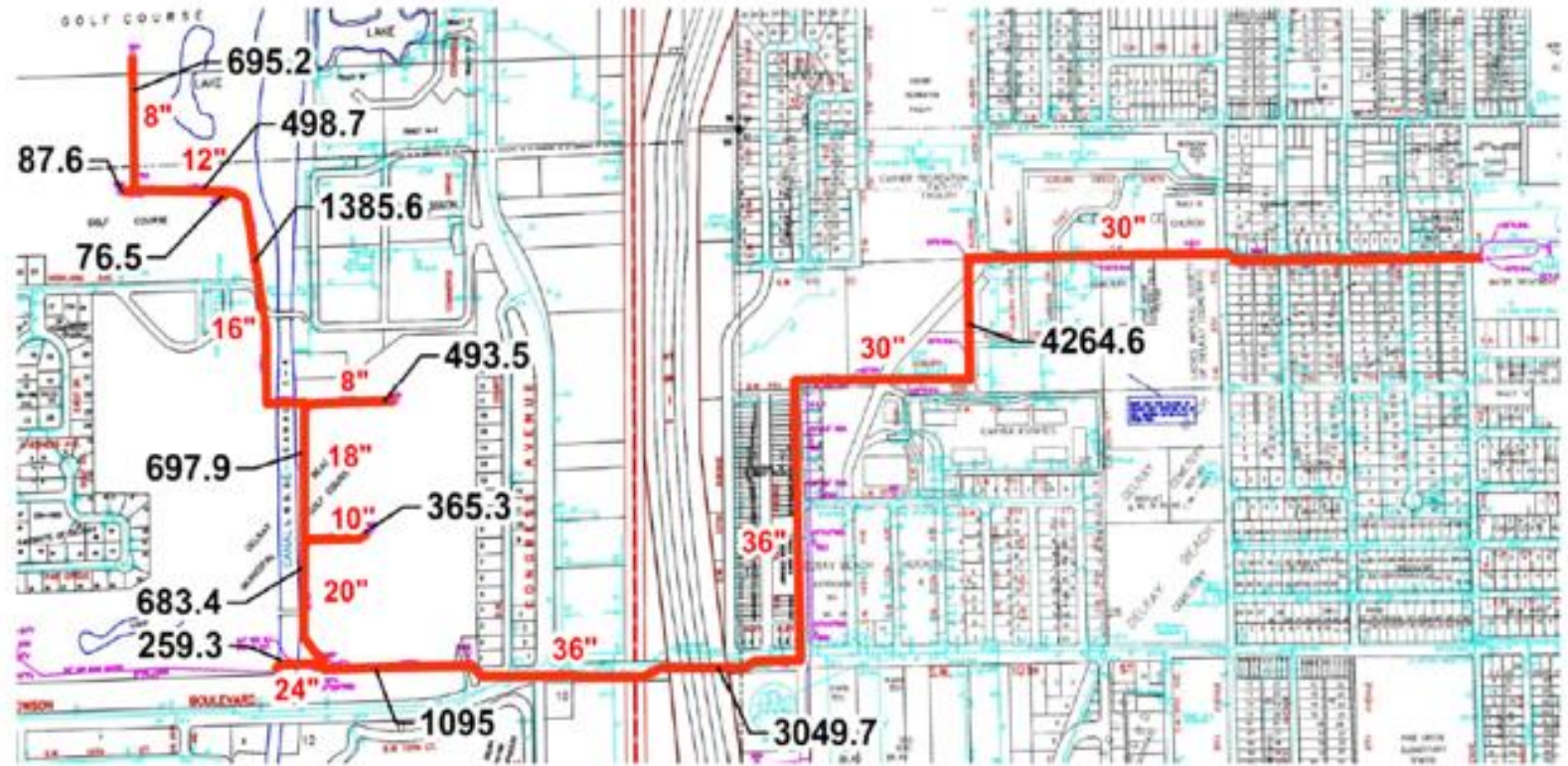
# T-7.1 Golf Course Raw Water Transmission Main Replacement