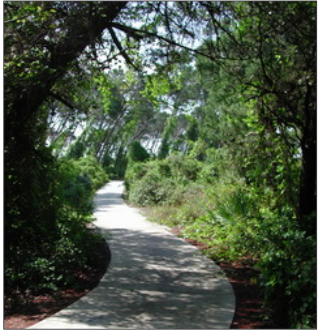
Leon M. Weekes Environmental Preserve

Preserve Area Parks are natural areas protected for their environmental or ecological value and preserved and managed for conservation purposes. Improvements are usually limited to the provision of nature trails. The Delray Oaks Preserve (owned by Palm Beach County), Lake Ida Open Space, Leon Weekes Environmental Preserve and the Donnelly Tract are four Preserve Area Parks within the City of Delray Beach.