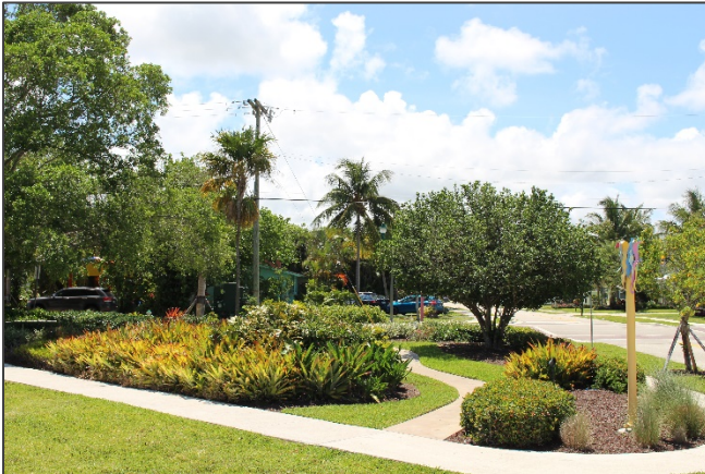
Del Ida Park