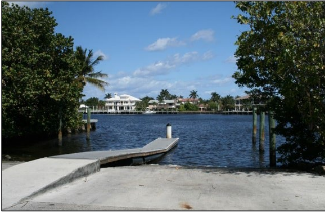
Boat ramp at Knowles Park

Delray Beach waterfront assets include the municipal beach, the Intracoastal Waterway, several lakes and canals. The promotion of recreation and marine facilities is a major priority of the city's park system. These facilities include the City Marina, and boat/marine access facilities located at Knowles Park, Lakeview Park and Mangrove Park.