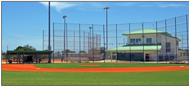
Athletic fields at Miller Park

of lighted fields or courts suitable for scheduled athletic league activities, exercise trails and support facilities such as restrooms and concessions with bicycle and automobile parking areas and pedestrian path systems to accommodate park users. Special facilities such as recreation centers, competition swimming pools, golf courses, and boat ramps and docks may also be provided within district parks. The Robert P. Miller Park and Lake Ida Park (owned by Palm Beach County) are examples of district parks which offer different activities but intrinsically serve a broader community and purpose.