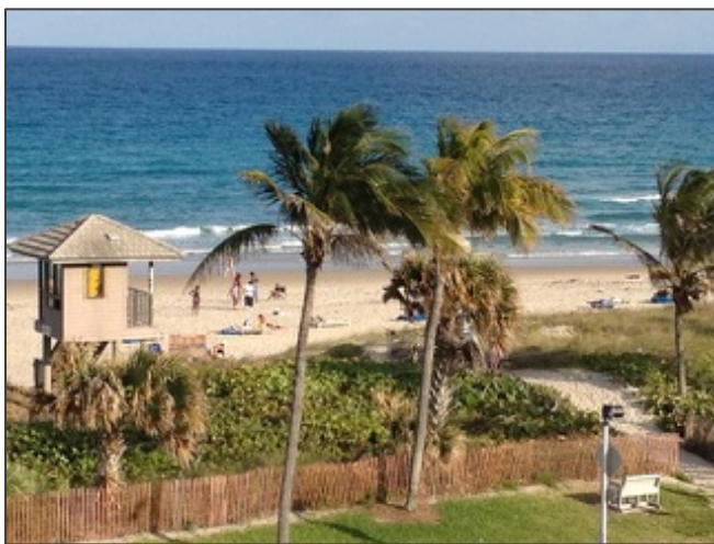
Delray Municipal Beach

The special use classification covers a broad range of parks and facilities oriented towards a single-purpose use, such as, the municipal beach, golf courses and the cemetery. Other facilities such as cultural facilities, marine facilities, greenways and linear parks and preserve areas are also incorporated within the special facilities parks category.