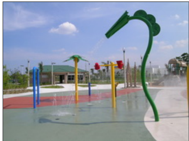
Catherine Strong Community Park

Community parks are usually more than five acres but less than 25 acres in size, providing active and, to a lesser degree, passive recreational facilities to population areas within three miles of the facility. Recreational facilities include play areas, small groups of lighted fields or courts suitable for programmed activities, and community centers. Bicycle and automobile parking areas and pedestrian paths provide access to the facility.