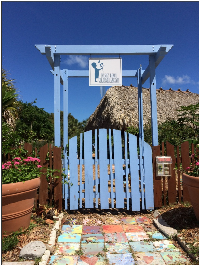
Community Gardens for all ages are desirable parks.