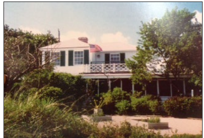
Sandoway Discovery Center