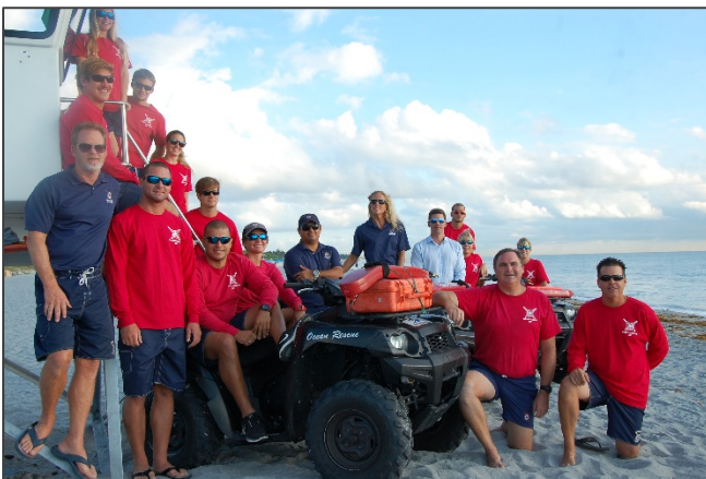
The City's award-winning Ocean Rescue team.