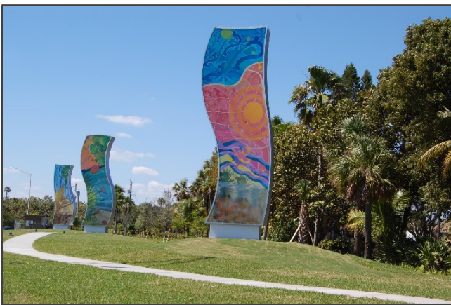
I-95 and West Atlantic Avenue

These parks are primarily located along the streets and provide interest, public art and unique landscape features. Four greenway/linear parks are located within the City and include the I-95 Gateway Parks, the Martin Luther King Drive Public Plaza, Pioneer Park and the Beach Promenade, which is also incorporated within the municipal beach.