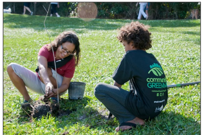
Community Greening working to increase the tree canopy

Expand tree canopy within parks and other recreation locations to improve community health benefits, reduce heat islands, and encourage conservation effort. Prioritize expanding the tree canopy within the public rights-of-way in areas that are largely developed with few opportunities to establish new parks and open space.