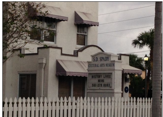
SD Spady Cultural Arts Museum