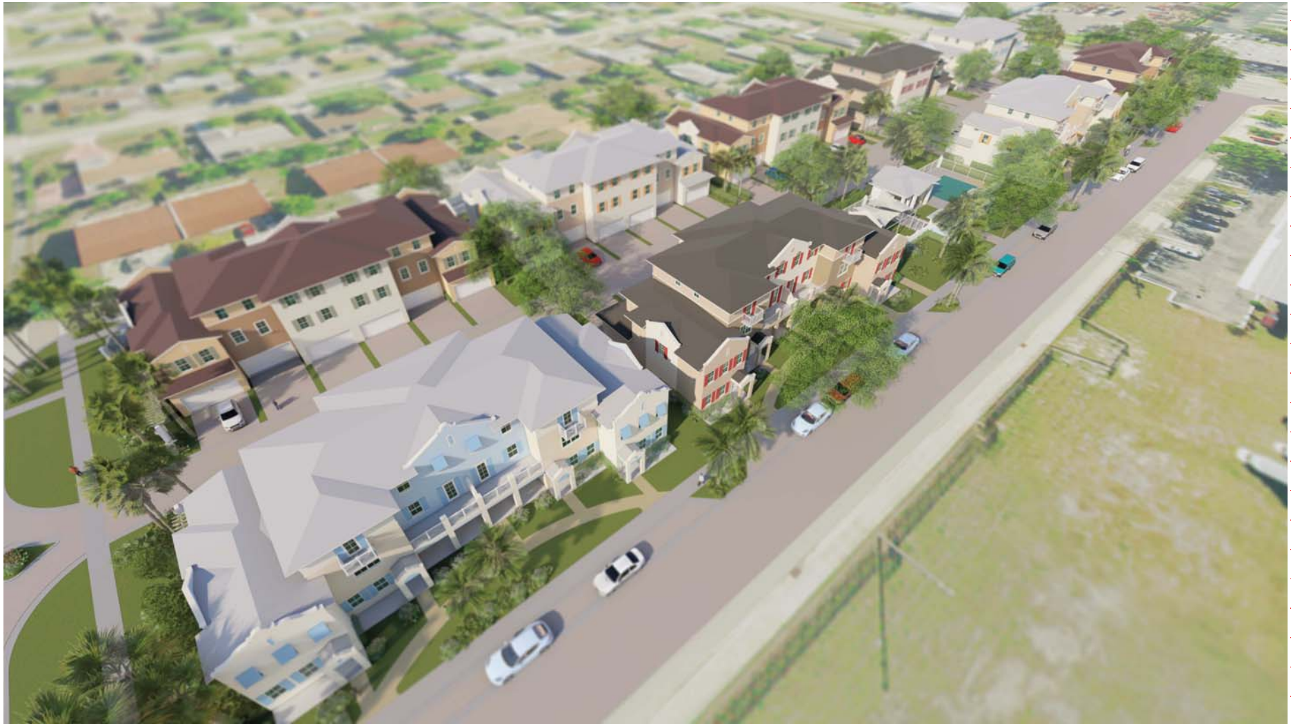
PROPOSED BIRD'S EYE PERSPECTIVE

REG Architects Interiors Planners CORP# AA0002447