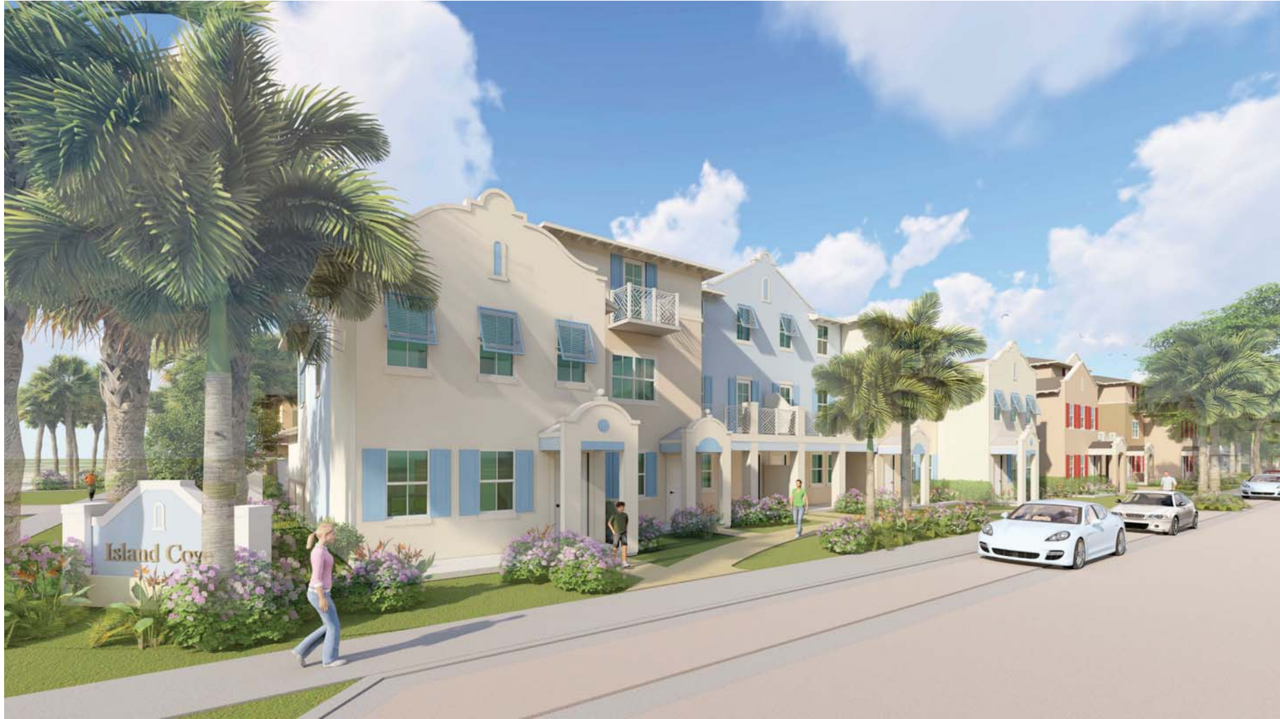
PROPOSED SOUTH EAST ELEVATION PERSPECTIVE