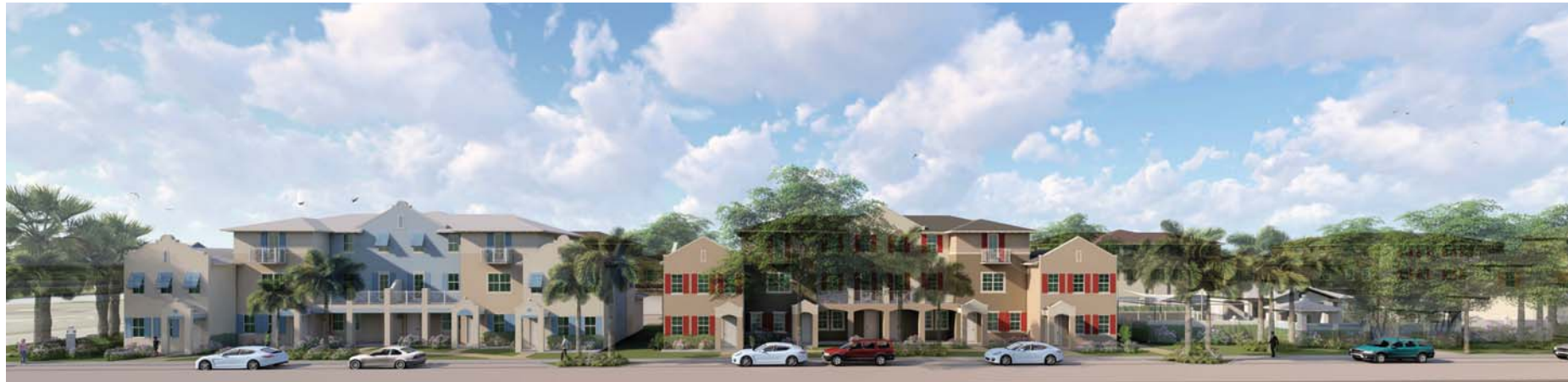
PROPOSED EAST ELEVATION PERSPECTIVE