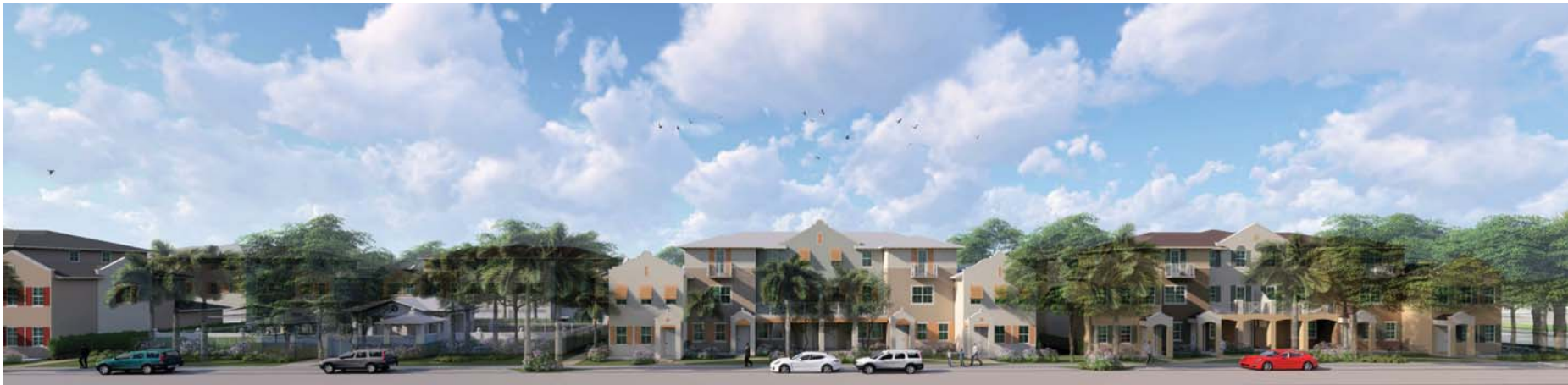
PROPOSED EAST ELEVATION PERSPECTIVE

REG Architects Interiors Planners CORP# AA0002447